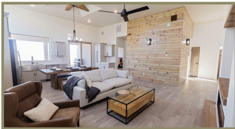
Open Concept Living Space