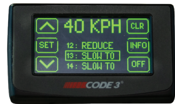
O-LED touchscreen controller