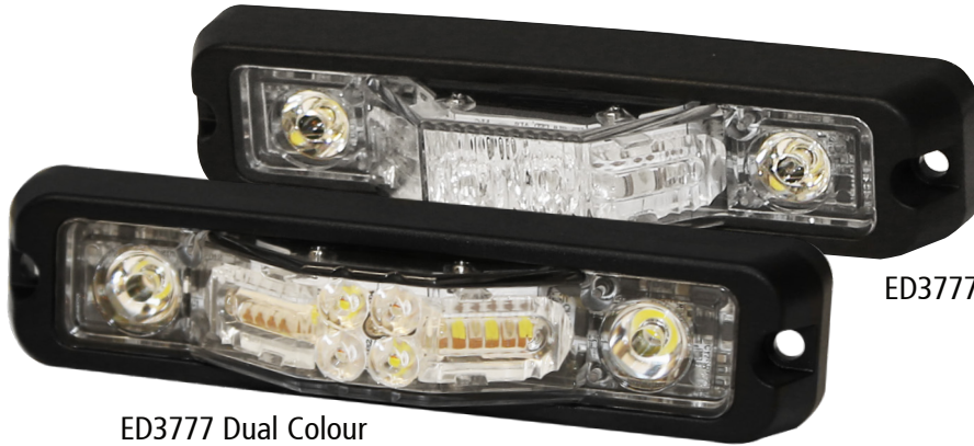
ED3777 Dual Colour