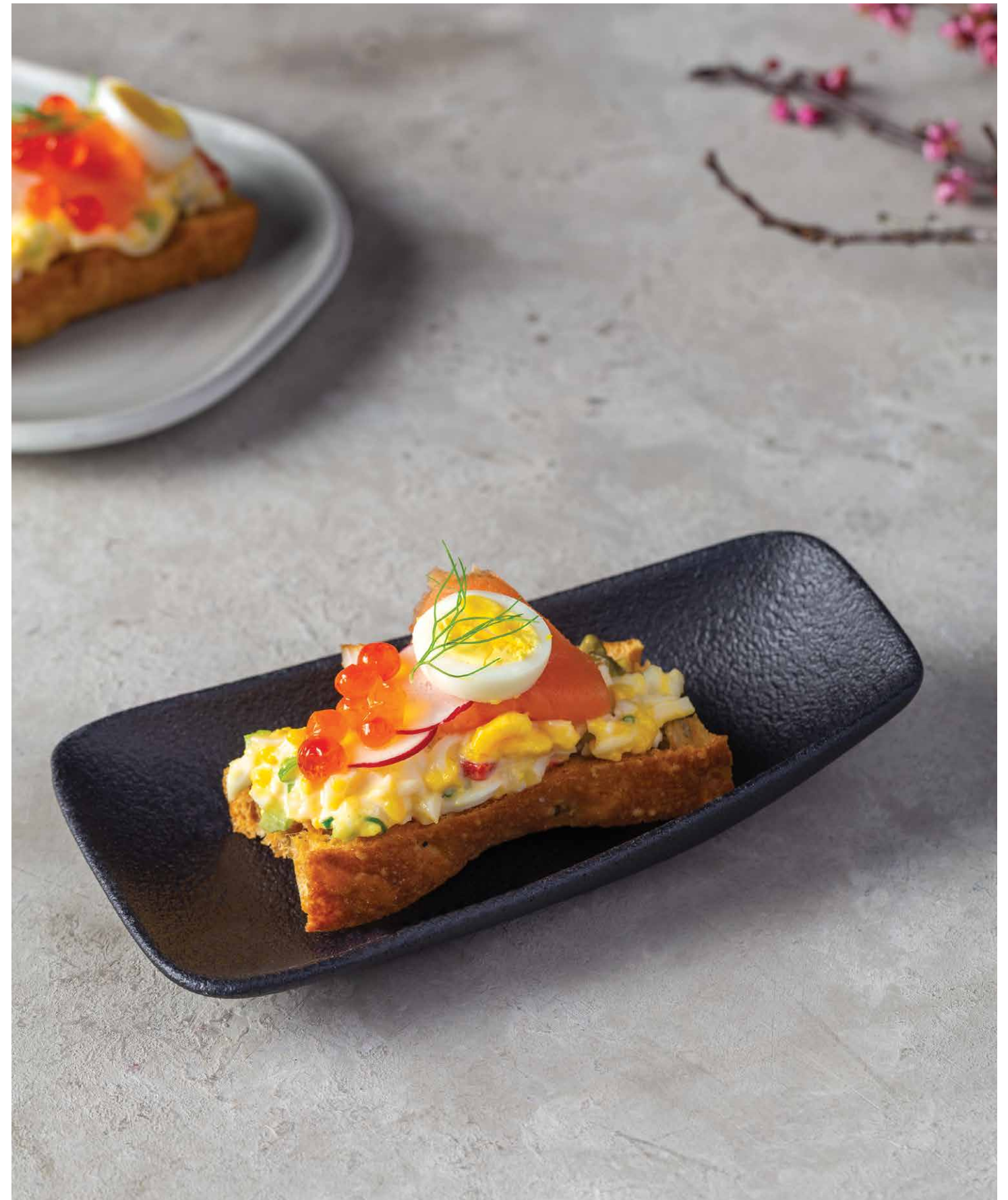
Smoked Fish and Egg Tartine Seasonal vegetables, celery, cornichons, dill, toasted sourdough