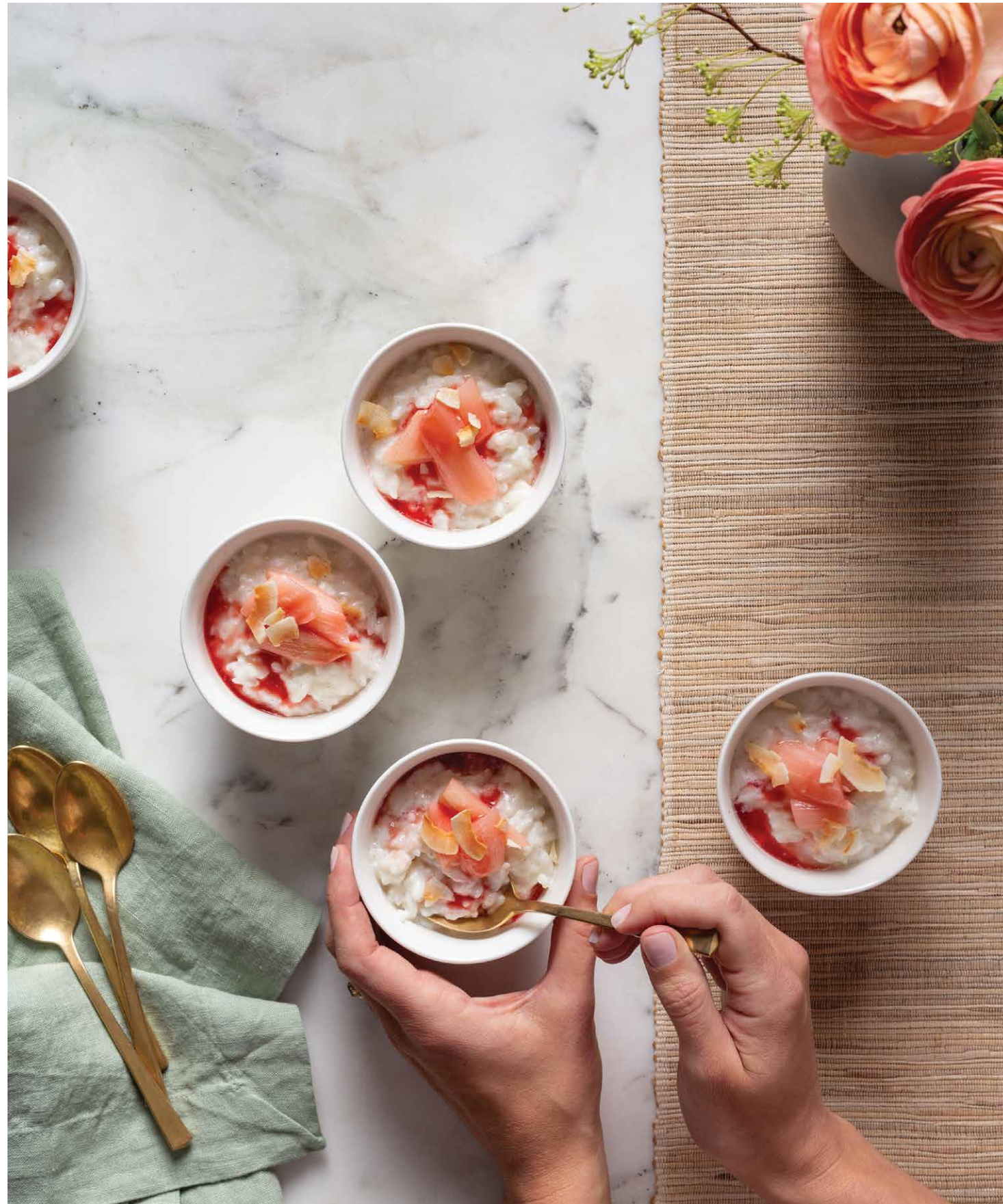
Roasted Rhubarb Rice Pudding