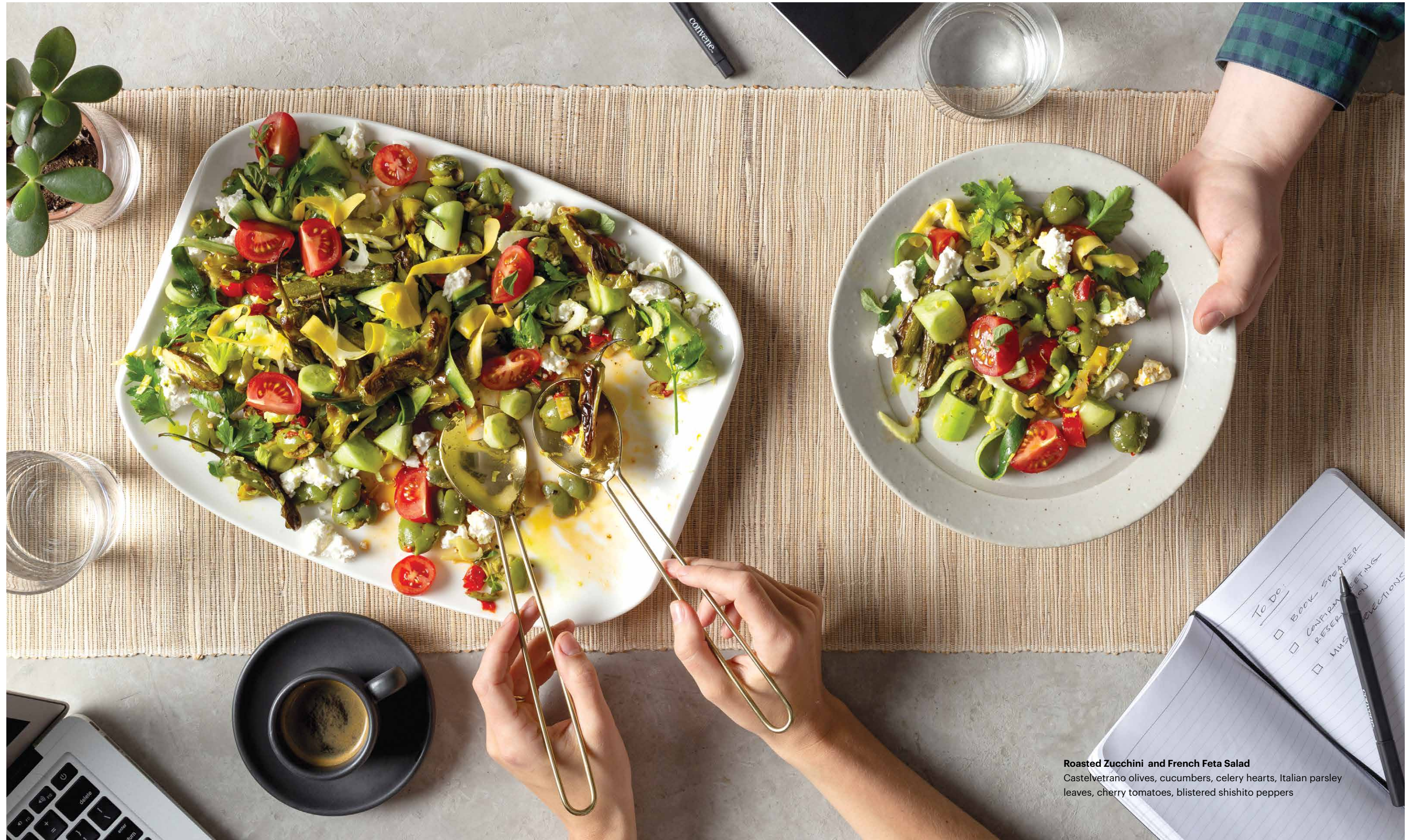
Roasted Zucchini and French Feta Salad Castelvetrano olives, cucumbers, celery hearts, Italian parsley leaves, cherry tomatoes, blistered shishito peppers