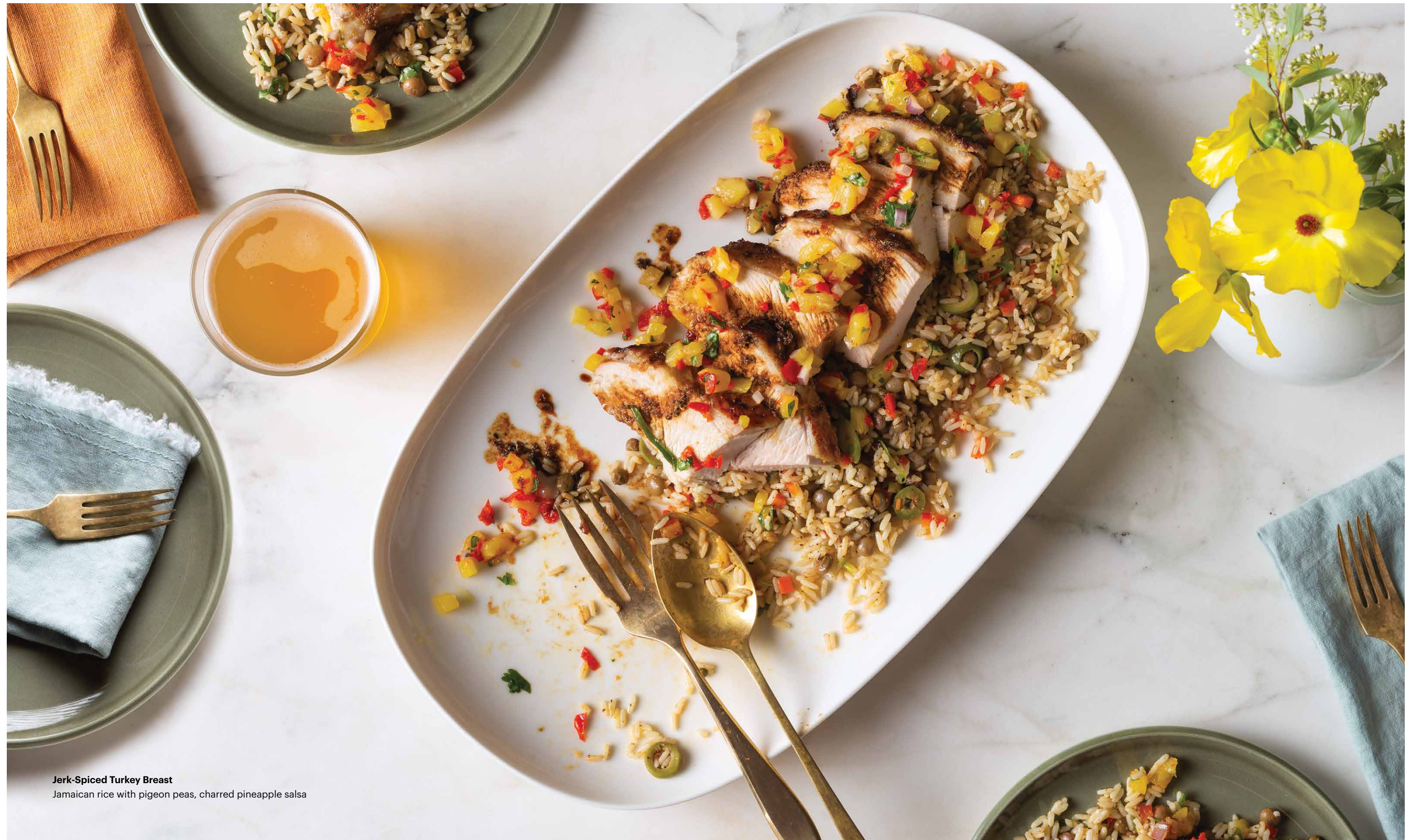
Jerk-Spiced Turkey Breast Jamaican rice with pigeon peas, charred pineapple salsa