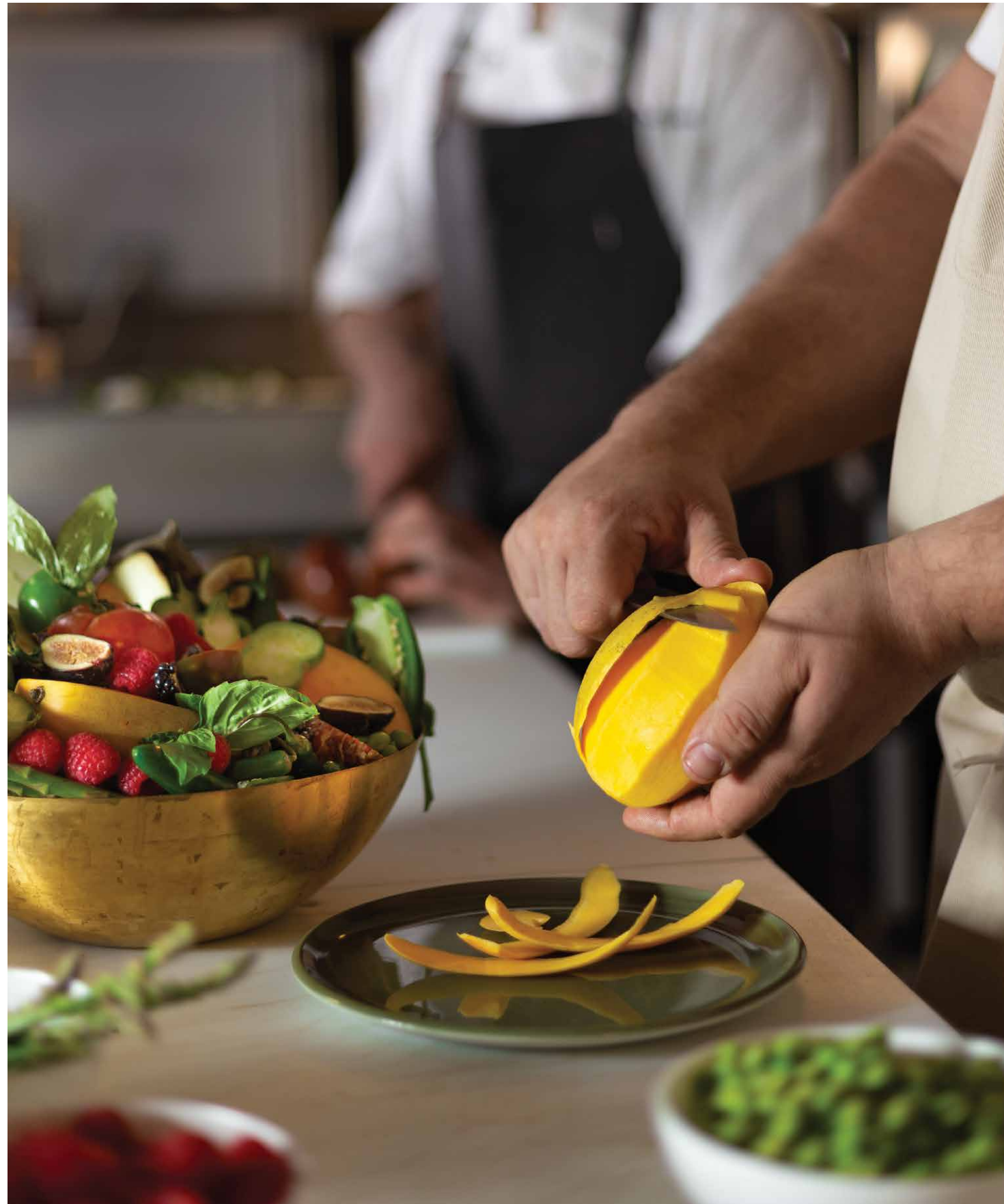
Seasonal Sliced Fruit