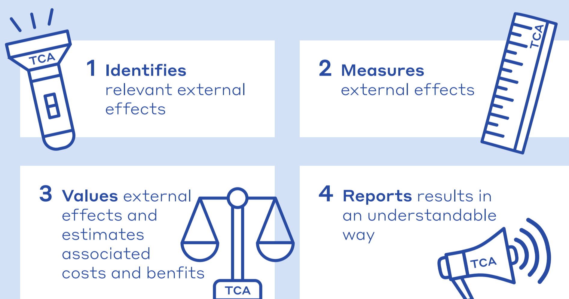
Figure 2: The tools of True Cost Accounting (TCA)

At TMG, we recognize the urgent need to transform the global food system to support the resilience of ecosystems, ensure equitable access to sufficient, safe, and nutritious food for all, and provide secure livelihoods for farmers. TCA is a prerequisite for food systems transformation because it recognizes the positive and negative externalities. We advise and shape agri-food policy reforms at national and international levels. We seek to build broad alliances to co-design economic systems that reduce the negative externalities of food systems and open pathways for their transformation.