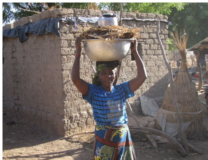
Local users are envisioned to actively participate in the management of the forest.

The participatory forest management plan of the Three-Rivers gazetted forest presents a multitiered arrangement through co-management structures involving participatory approaches between the public sector and the local population. The management plan envisages collaboration between the