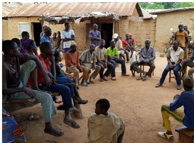
Village meeting in Karakou-Daassi, a hamlet of Kabanou village.

The conflict lines and challenges described here are characterised by a pronounced power imbalance and significant socio-economic inequality between the stakeholders involved. A few actors, including the local forest administration and a few influential and often well-off farmers, have far better opportunities to represent or assert their interests against other conflict parties. The vast majority of the heavily impoverished local population, on the other hand, is repeatedly affected by the marginalisation of their interests.