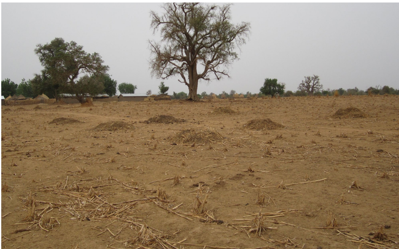
Land use in northern Benin is under scrutiny in the context of LDN initiatives.

TMG Research follows the concept of a counter current principle, reasoning that international reporting processes require well-founded contextual information generated from experience and local knowledge. At the same time, local knowledge and experience, for example generated through participatory tenure mapping, can better inform and shape policies at national and international level thereby increasing accountability at various levels.