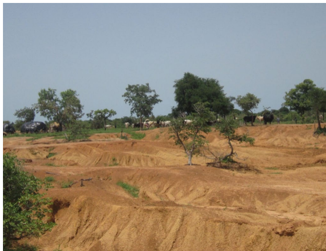
Severe soil erosion in Tchaourou municipality, Benin.

“The annual cost of land degradation in Benin is estimated at US$490 million.”