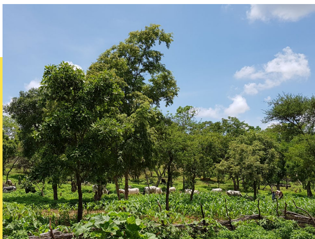
Reconciling land use and resource conservation is key to the success of LDN initiatives in Benin.

Both objectives are based on granting all stakeholders improved access to information, as well as the promotion of transparency and participation in the process of forest management and land governance. The relevant information is obtained, shared, and monitored based on a variety of methods. Of central importance is the participatory tenure mapping approach which systematically draws on the active participation of the local community to help identify and monitor legitimate tenure rights and potential conflicts.