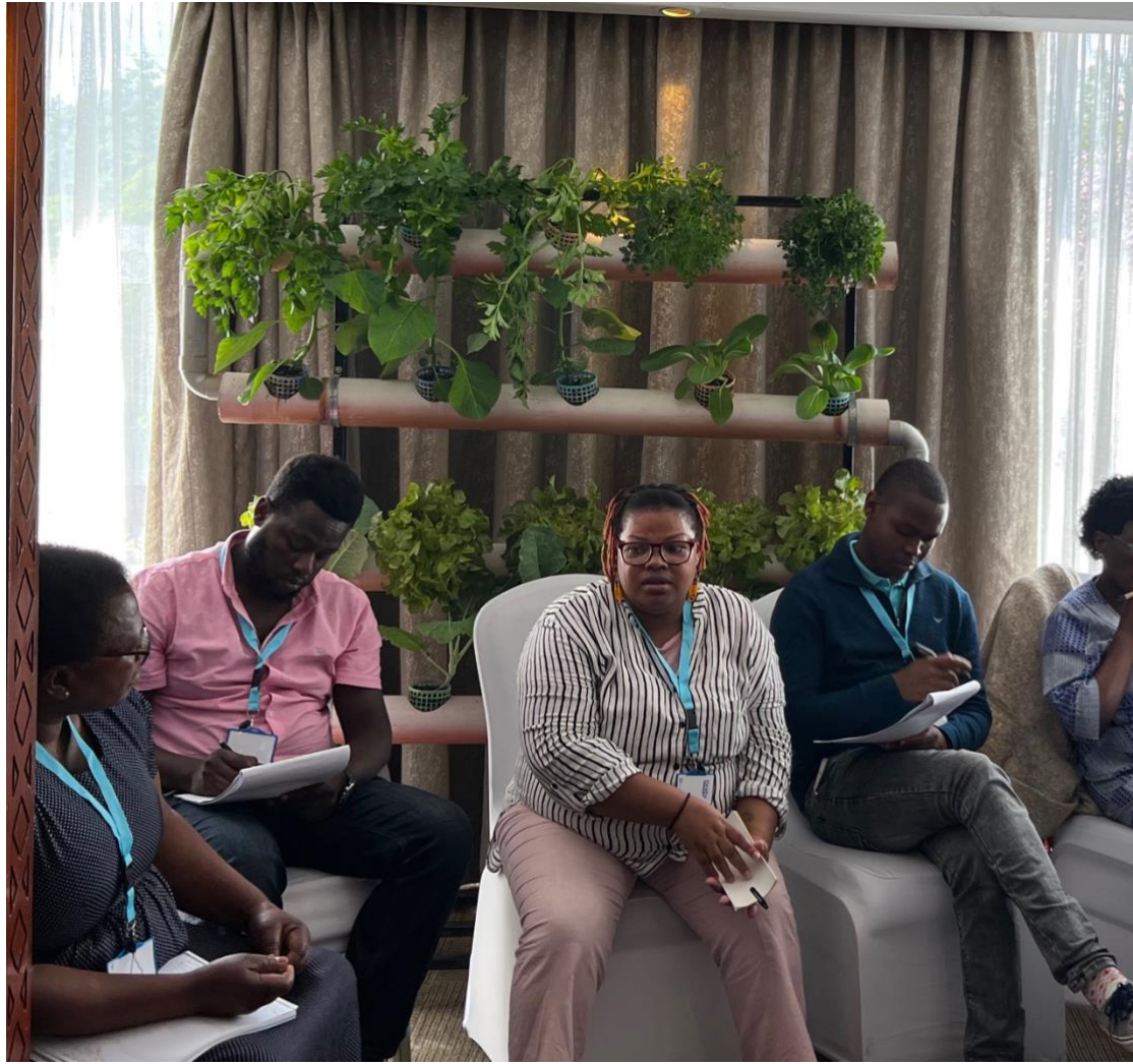
A hydroponic agriculture installation showcased by Miramar during the event.