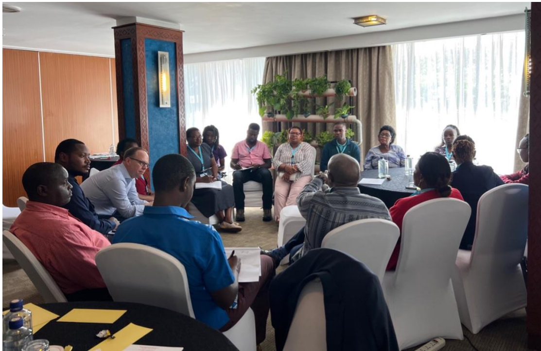
Focus group discussions