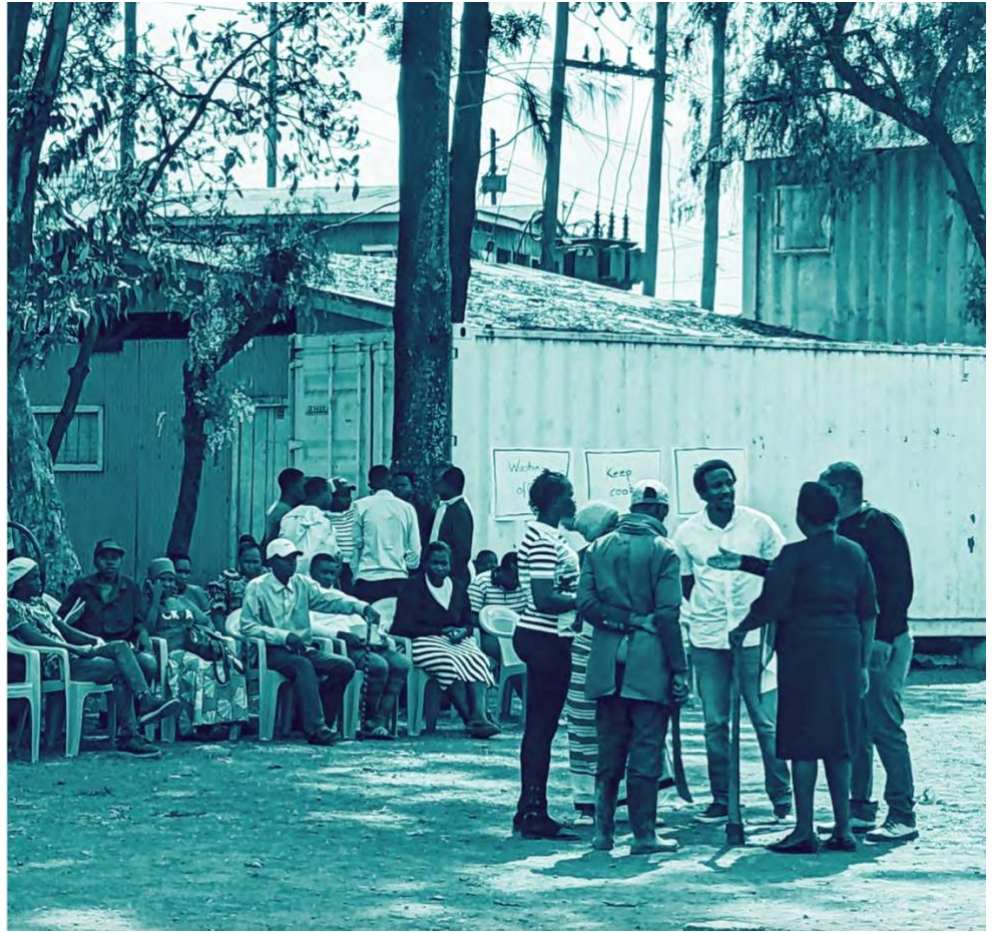
TMG and partners at an Urban Food Futures workshop with Mukuru community members

On the sustainability of the Urban Food Futures project, Paganini acknowledged the need to develop robust indicators of successful innovation that can be further adopted and scaled.