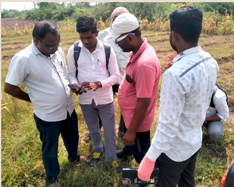
Group training on the E-PAVAS app

Through E-PAVAS, SOPPECOM and TMG aims to continue supporting WUAs in Atpadi and other regions in Maharashtra, fostering sustainable, effective, and inclusive water governance. We aspire for this initiative to advance climate-resilient agriculture as well as strengthen water management capacities through digital technologies.