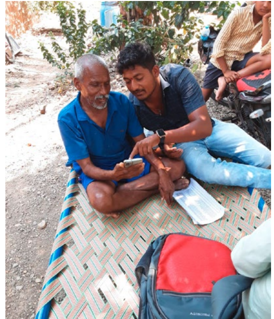
Young community resource person showing a senior farmer the functions of E-PAVAS

For decades, the grassroots movement Shramik Mukti Dal Samaan Paani Vatap Pani Sangharsh Chalwal (Social Movement for Equitable Water Distribution) has advocated for restructuring the public irrigation system, the Tembhu Lift Irrigation System (TLIS), on equitable lines. After years of struggle and negotiations with the government, the TLIS has been restructured to achieve equitable distribution in three talukas: Atpadi, Sangola, and Tasgaon in the Sangli district. This system ensures that every family will receive 5000 m 3 of water (1000 m 3 per person) for their livelihood needs. Water Users Associations (WUAs) will manage and govern this water in an integrated, equitable, and participatory manner. Atpadi, Sangola, and Tasgaon have been selected as pilot sites for the implementation of equitable water distribution.