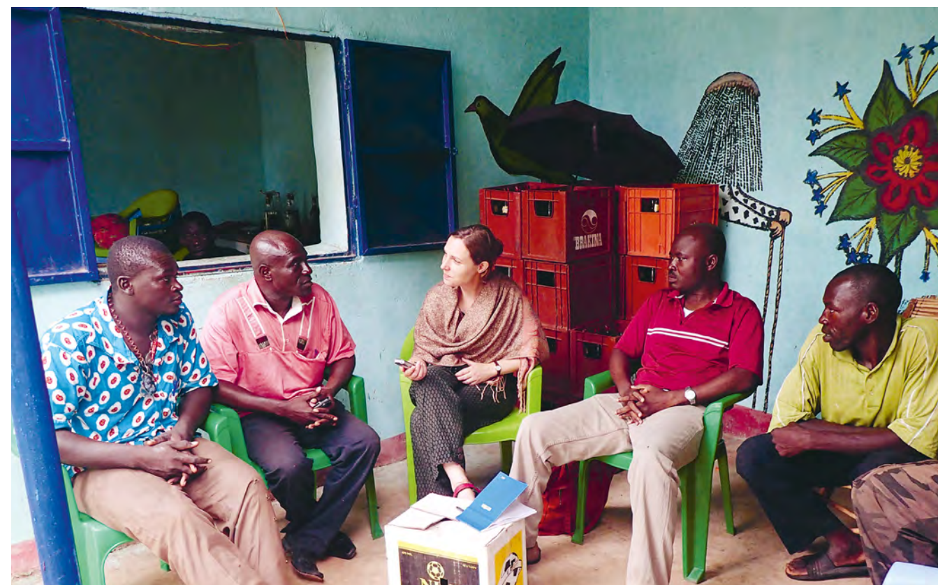
Photo 1: Focus group discussions with smallholder farmers

Raising participation along with agricultural productivity of female farmers has been an important vehicle to increase the continent's food supply (Palacios-Lopez, Christiaensen & Kilic, 2015). It is estimated that 55% of the gains in the fight against hunger between 1970 and 1995 in 63 developing countries were due to the improvement of women's position in society (Smith & Haddad, 2000).