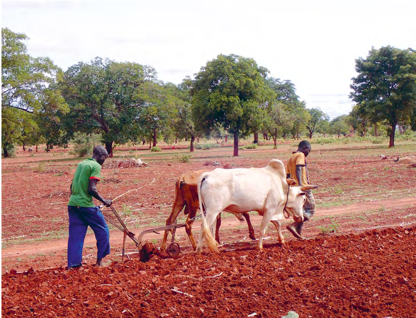
Photo 2: Young men ploughing the field with oxen on the family field in Tiarako, Burkina Faso