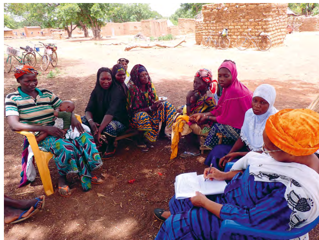
Photo 4: Focus group discussion with migrant women to understand their specific challenges in investing in soil protection, Bouéré, Burkina Faso