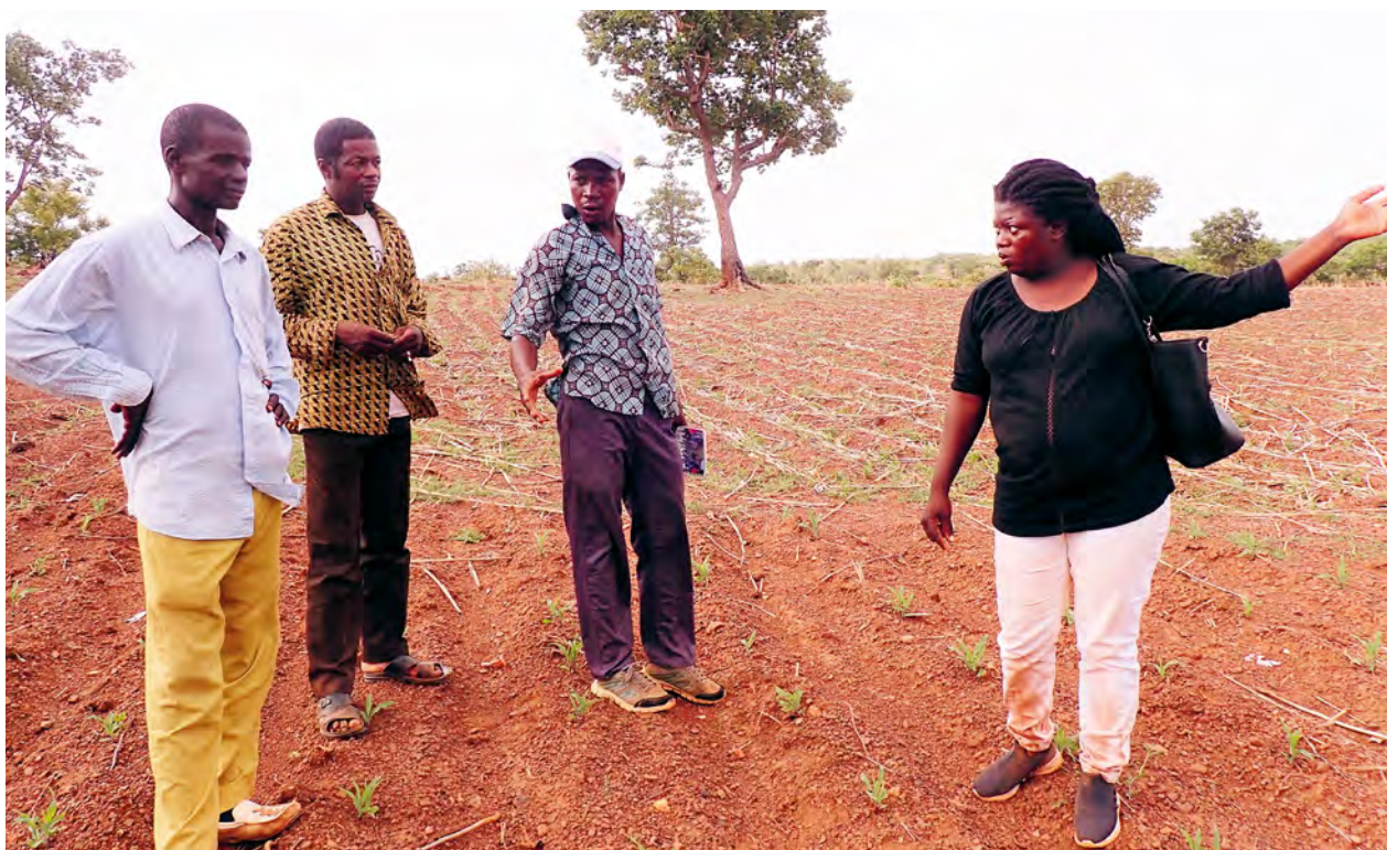
Photo 3: Female extension agent with male farmers in Bouéré, Hounde district, Burkina Faso – a rare picture

Soil protection starts with knowledge. Gender-discriminatory norms, attitudes and behaviours that limit women's access to information need to be challenged.