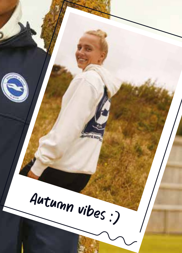
Autumn vibes :)