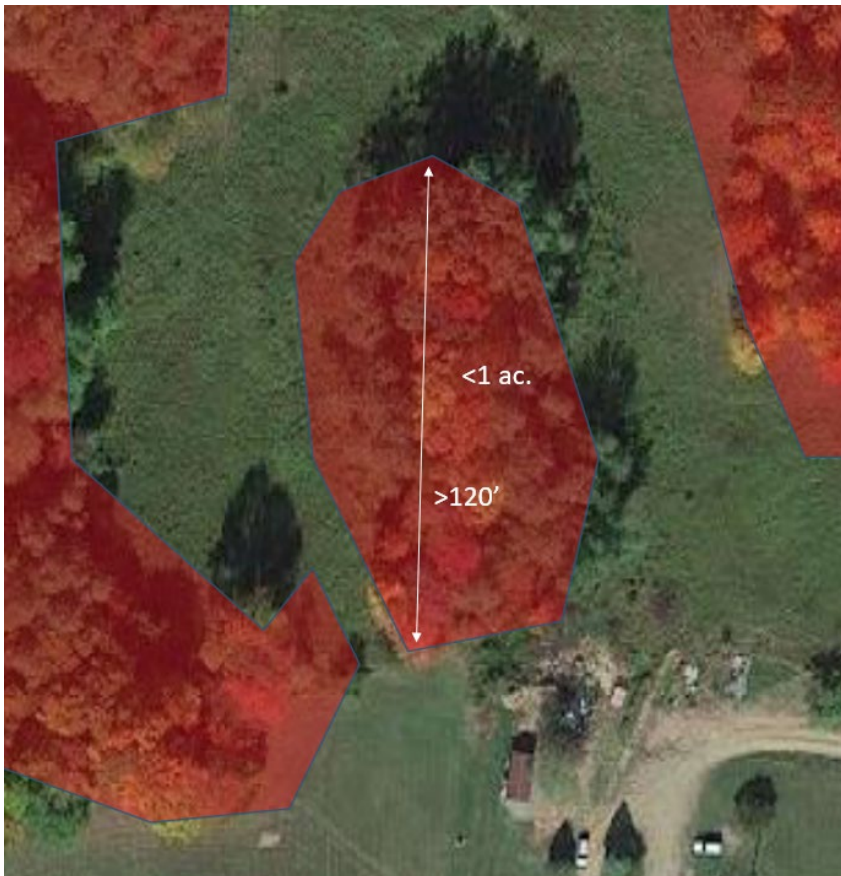
Figure 5. This area is at least 120' wide at its widest, but it is less than one acre in area. The non-forest areas around it are greater than one acre in size. Thus, the noted island would be excluded.