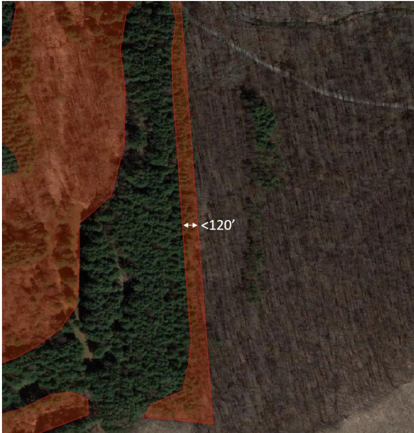
Figure 2. Even though the area in question (red) is less than 120' wide, it is a component of a larger forested block that is at least one acre in area and at least 120' wide. Thus, the area is not excluded.