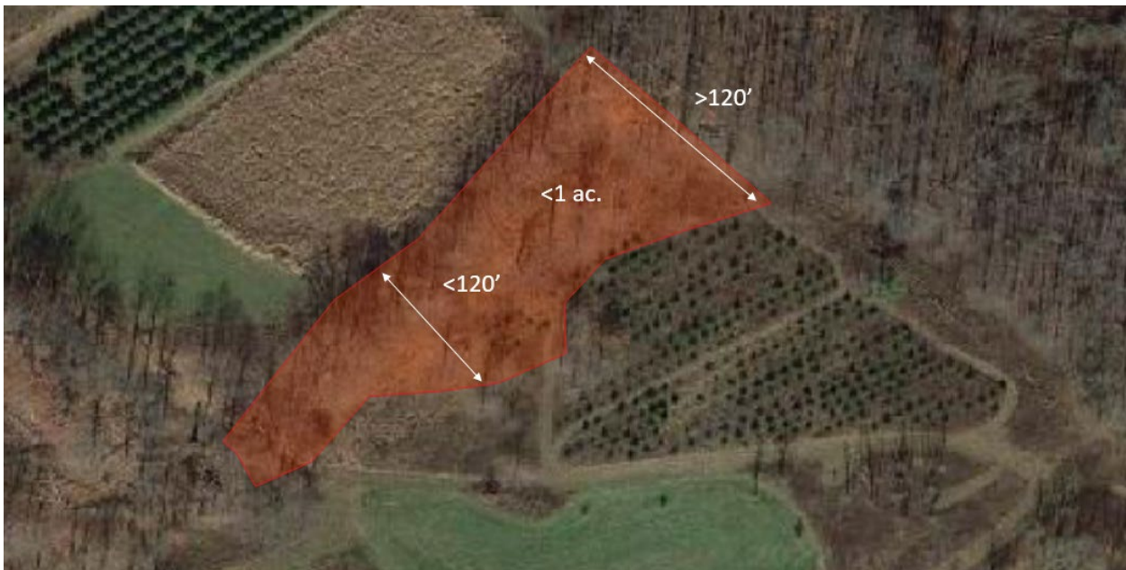
Figure 3. The area in question (red) is less than 1 acre but is part of a forested area greater than 1 acre. At its widest, the area is at least 120', so it is included.