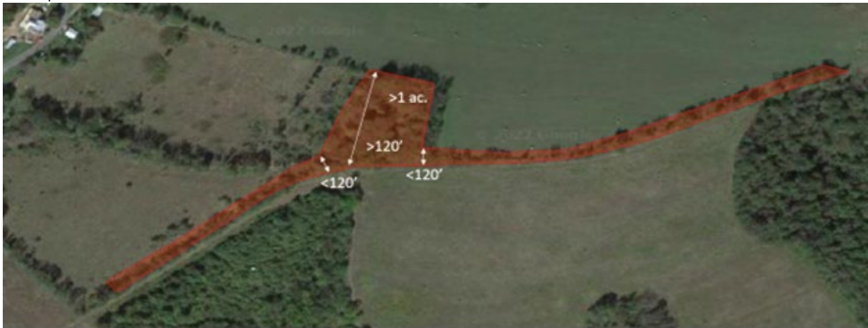
Figure 1. The area in question (red) is greater than 1 acre, but it includes areas with tree cover that are less than 120' wide. However, at its widest, the area is at least 120' wide, so the entire polygon is included.