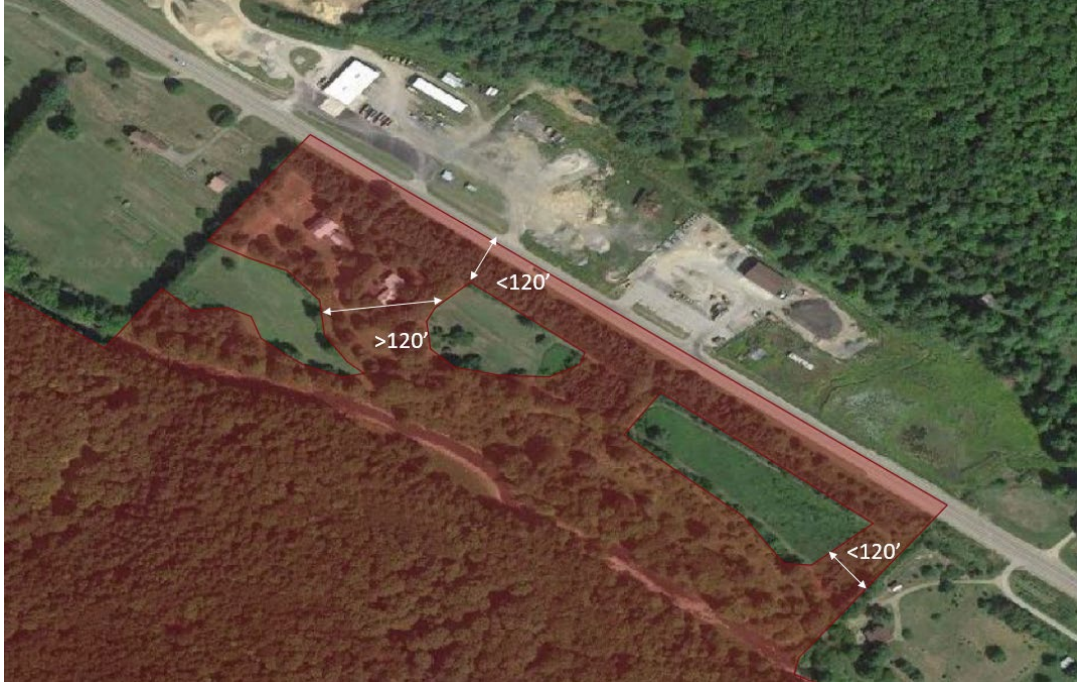
Figure 4. A complex example with all areas included. Even though some sections are less than 120' wide, at the block's widest, it is at least 120' wide.