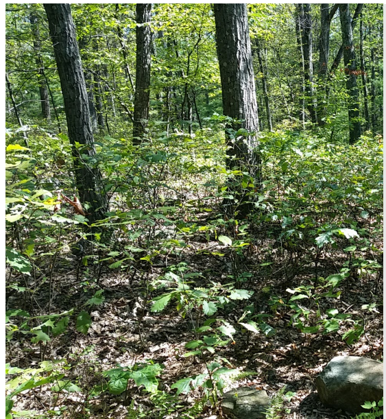
To grow a new oak forest, oak seedlings must be present before conducting a timber harvest.

Landowners should plan to invest financially in areas where oak regeneration is recommended. Regenerating oak can be challenging but is very important for long-term management.