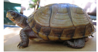
Three-toed Box Turtle

Box turtles love to burrow and prefer to hide by making shallow burrows in the substrate. A mixture of several of the following is best: organic soil, coco coir, peat moss, sphagnum moss, and/or dead leaves. Avoid cedar/pine/aspens mulches, sand, alfalfa pellets, and sand. Live plants can be planted directly in the substrate (though your turtle may damage them) or kept in pots in the enclosure to provide cover and enrichment for your turtle.