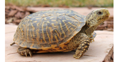
Ornate Box Turtle