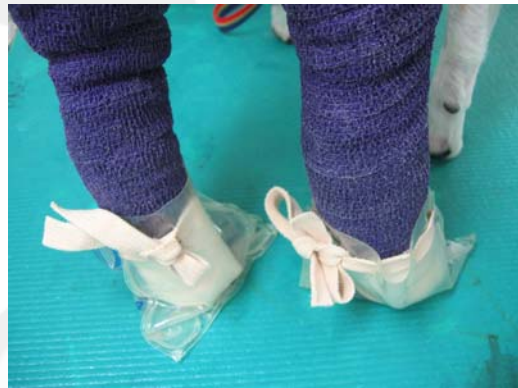
Protect bandage when going outside

An Elizabethan collar is used to prevent the animal from licking or chewing the bandage or incision. Contact us if your pet does not tolerate the Elizabethan collar. We can make suggestions for alternative forms of restraint for your pet. It is, however, important to prevent licking or chewing the bandage or incision line.