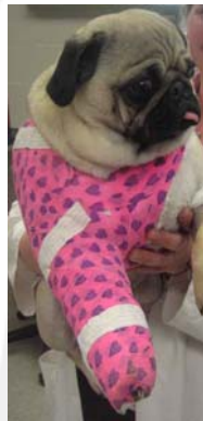
Keep bandage dry