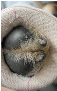
Check the toes for swelling 2x/day

Bandage care is imperative to prevent problems during the recovery period. The bandage must be kept dry and clean. Place a sturdy plastic bag over the bandage when going outside, and remove it when back inside. Do not allow your pet to step into a water puddle. Do not allow your pet to lick or chew on the bandage. The bandage material works like a wick in an oil-lamp, and any moisture that is apparent on one end of the bandage, is likely to move up on the inside of the bandage, possibly leading to skin infection. Please contact us immediately if the bandage becomes wet, loose, or damaged. Even if there is no damage to the bandage, frequent bandage changes may be necessary to minimize the risk of complications, such as pressure sores underneath the bandage.