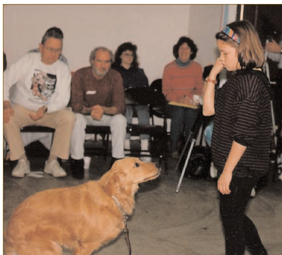
By coming when called and sitting on request, a puppy demonstrates willing compliance and shows respect to his trainer—a child.

Give children tasty treats such as freeze-dried liver as well as kibble to use as lures and rewards during handling and