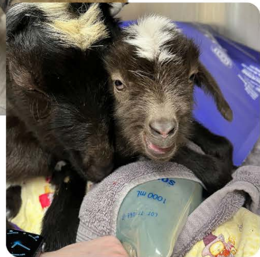
Mama (Delores) and baby boy

This little baby goat and mama, Delores (see picture to the right) were an emergency c-section done just last month! Our team was able to not only evaluate that baby was stuck, but we were able to prep the surgical suite, complete the c-section, revive the baby, introduce mama, and baby (including the baby sister that was born earlier), and send home within just a few hours!