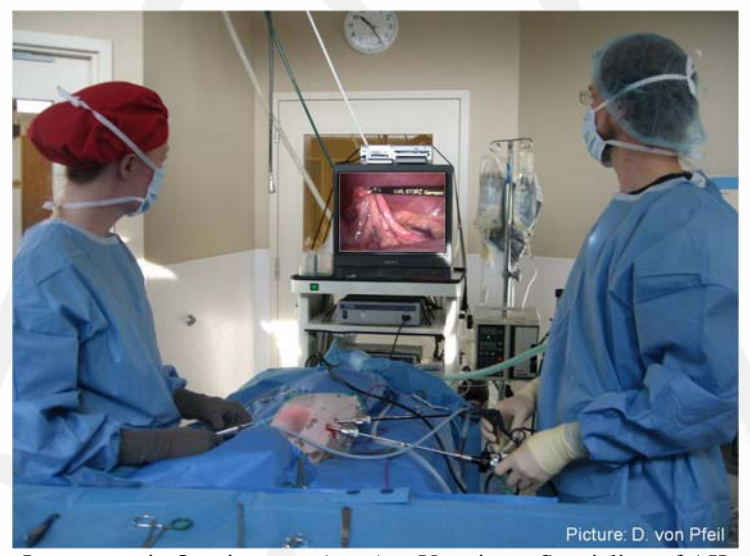
Laparoscopic Ovariectomy (spay) at Veterinary Specialists of AK.

These techniques represent advances in technology which have allowed the development of surgical fiberoptic cameras and light sources referred to as "scopes". Using this technology, the tip of a scope can be introduced into the body cavity through a small incision providing a magnified view of the inside of the cavity.