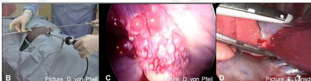
A: Standard open approach to the chest. B, C, D: Thoracoscopy to explore the chest. Note the difference in tissue damage using thoracoscopy compared to the standard open approach. C: Thoracoscopic view of chest wall disease. D: Close-up view of staple placement during thoracoscopic lung lobe removal.

One relatively common condition in dogs is pericardial effusion. This results in fluid filling of the pericardium, the sac that surrounds the heart. When this occurs, the pressure that develops interferes with heart function. For many of these patients, removal of the pericardium (pericardectomy) or creating a window in the pericardium is an effective treatment. This procedure can be done thoracoscopically, minimizing patient discomfort and recovery time. These advantages are why we try to use thoracoscopic procedures whenever possible.