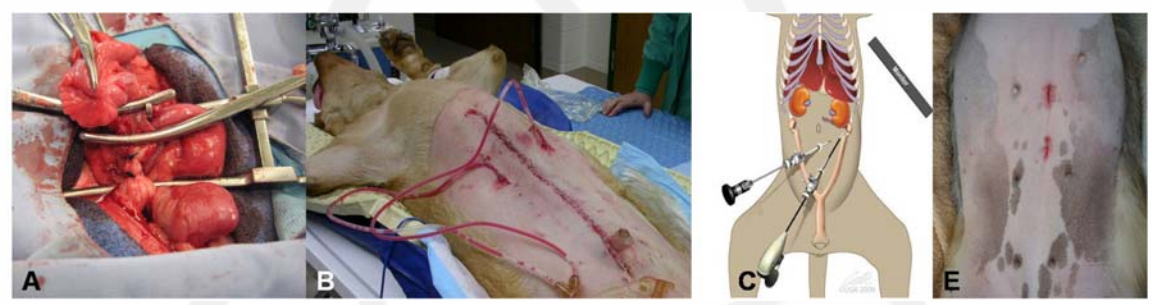
A: Spay using an abdominal retractor. B: Incision after an extensive abdominal procedure. C: Portal placement for laparoscopic spay. E: Incision after laparoscopic spay.

During laparoscopy, the abdomen is first distended with gas (carbon dioxide), and then the tip of a fiber optic camera or scope and instruments are introduced into the abdominal cavity to inspect the organs, and to perform various procedures. Because there is less tissue disruption than is associated with standard open procedures, there is usually less postoperative pain. For this reason, laparoscopy is often preferred over a standard surgical procedure especially in older, debilitated animals. Many of these patients can be released from the hospital on the day of surgery.