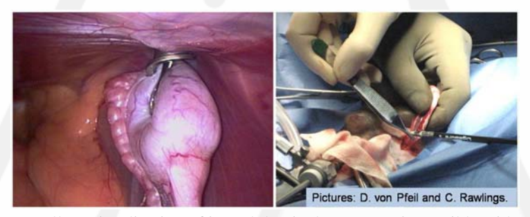
Excellent visualization of intraabdominal structures is possible with laparoscopy. This example shows removal of a retained testicle.