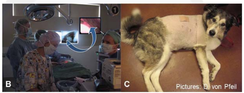
A: Intensive post-operative treatment after an invasive chest surgery using an open approach. Note the large bandage and recumbent dog. B & C: Thoracoscopic lung lobe resection at Veterinary Specialists of Alaska. Note the small scars & content dog after surgery.