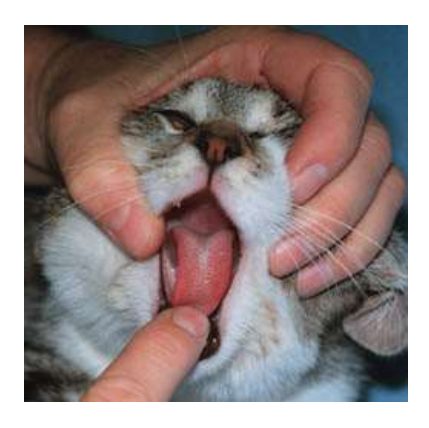
...and pull open the lower jaw.