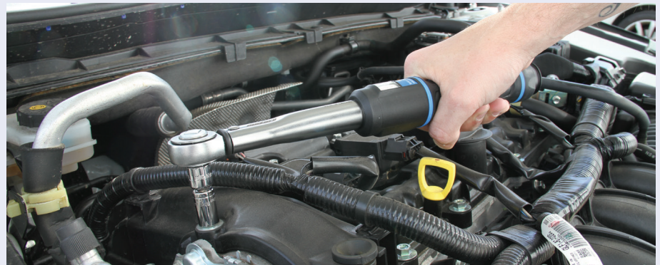
Push-Thru Ratchet Head