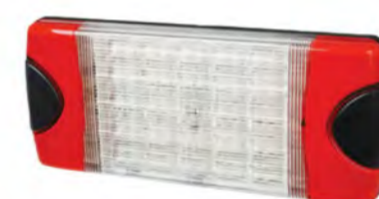
2378 Hella DuraLED Combi-S Lamp w/2.5m Cable $159.00 + GST