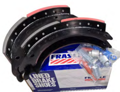
WT7701 Pair Lined 4515Q 16-1/2"x7" Brake Shoes w/ Kit $129.00 + GST