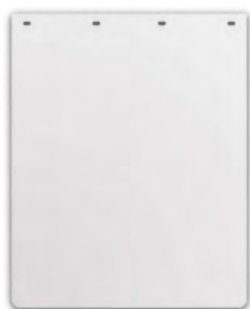
312424 Mudflap 24X24 White Polyarmour PVC $30.00 + GST