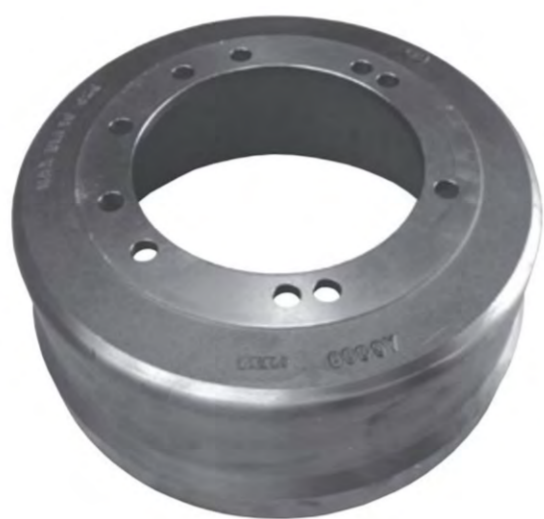
WT6602T Drum 419x178 General Trailer 5 Spoke Hub $179.00 + GST