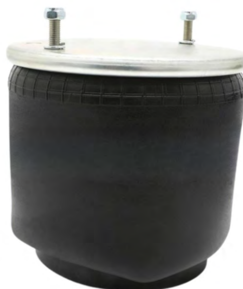
92605 Air Spring for ROR CS9 $179.00 + GST