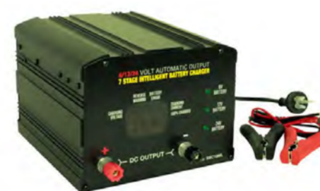
SBC10ML Smart Battery Charger 6V/12V/24V Auto Select $169.00 + GST