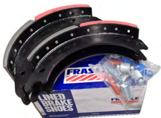
WT7704 Pair Lined 4524Q 16-1/2"x5" Brake Shoes w/ Kit $139.00 + GST