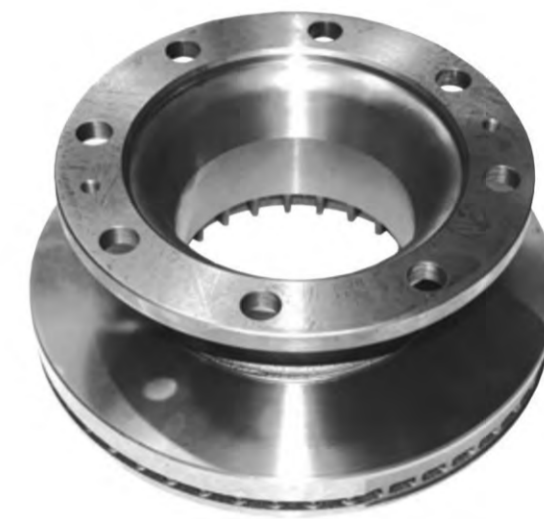
WT6802 Disc Rotor ROR 378 x 275PCD x 8ST $179.00 + GST