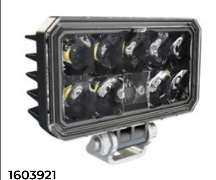
JW Speaker Compact LED Worklamp 12/24V