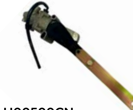
Height Control Valve - Hadley