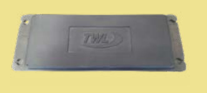
DECKPADS Deck Pad 280x100x15mm $59.00 + GST