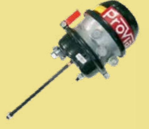
3030-P Wabco Provia 30/30 Springbrake Chamber $69.00 + GST $199.00 + GST