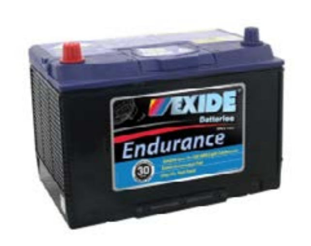
N70ZZMF Exide Endurance Battery 750CCA 12V