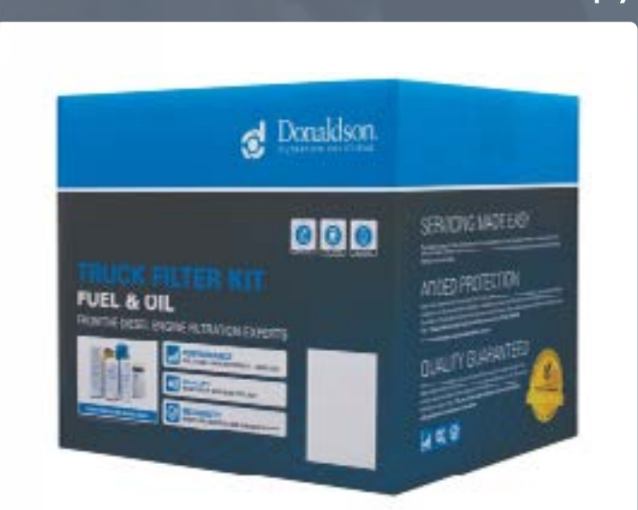
X903233 Donaldson Filter Kit Cummins ISX EGR $104.00 + GST