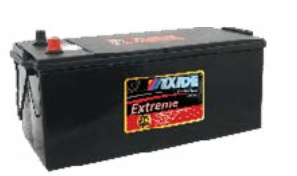
N150MFF Battery 1030CCA 12V (Assy F)