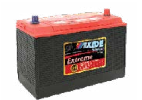
31-1100MF 1000CCA (Assy H SAE Post)