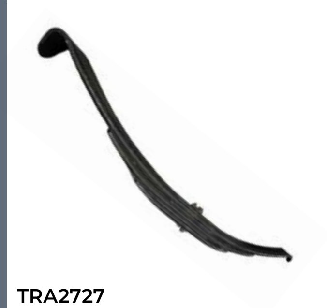
TRA2727 3 Leaf Med Arch Spring Hutch