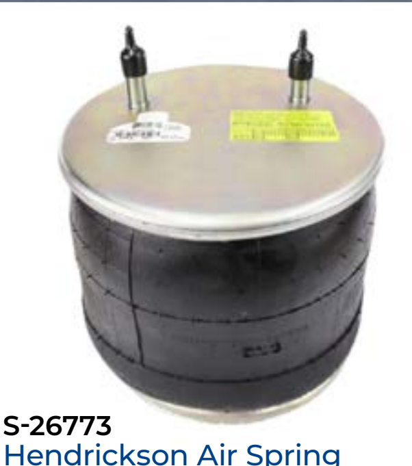
Hendrickson Air Spring AANT 23K 12"-13" $389.00 + GST