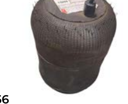
15956 Air Spring Merc Actros 2651LS $169.00 + GST