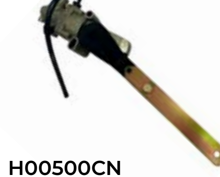
$239.00 + GST $39.00 + GST