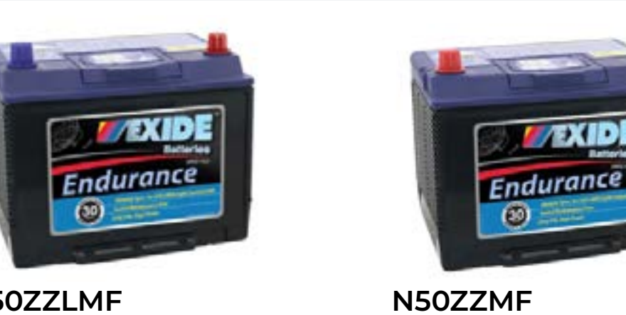
N50ZZLMF Battery 620CCA 12V (Assy C) TS Vent