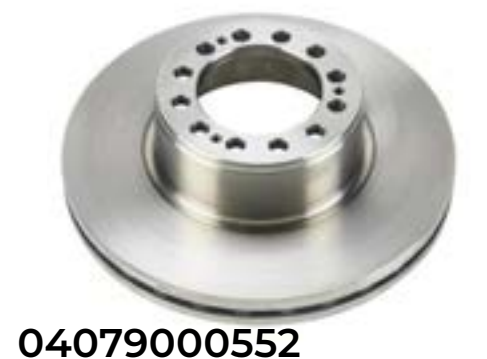
SAF Disc Brake Rotor SKRB9022 Ø430X45x114 $175.00 + GST