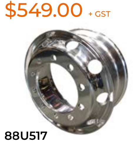
22.5 x 8.25/10 x 335 32mm OFF-168mm/ CBD-281mm LVL1