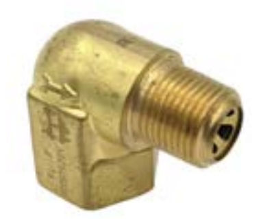
ABC505000 Check Valve SC3 -90Deg 3/8" M+F