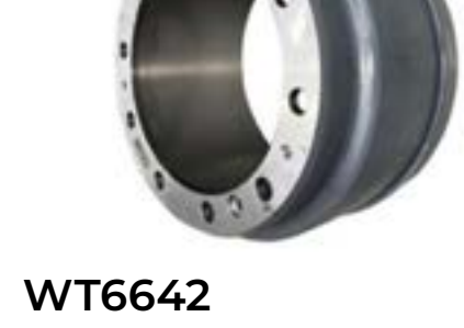
Brake Drum Scania Rear 413x210 10Stud 335PCD $195.00 + GST