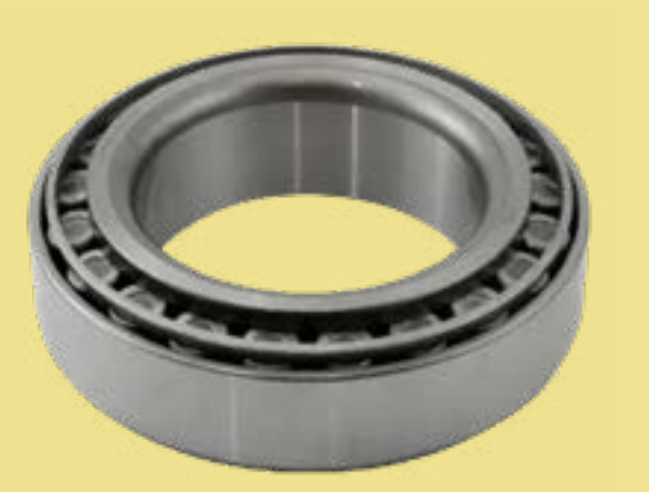
HM218248/10 Bearing Cup/Cone 88.975mm $99.00 + GST