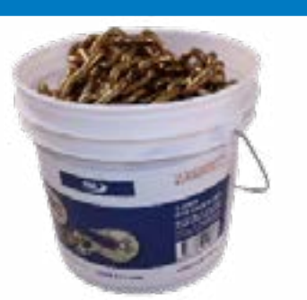
TC73BUCKET9M Transport Chain Kit c/w Winged Grab Hooks 7.3mm x 9M