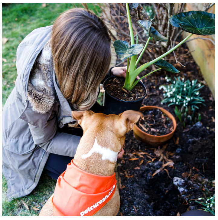
+ 31% increase YoY for employee participation in Sustainability Committee activities