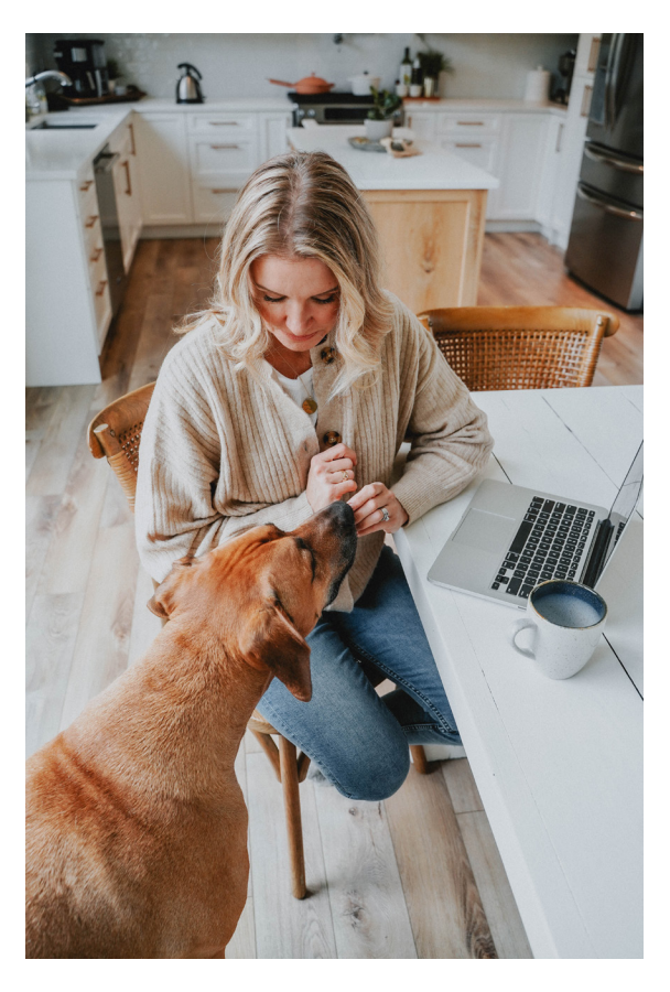
Policy implemented to formalize screening practices for charitable contributions