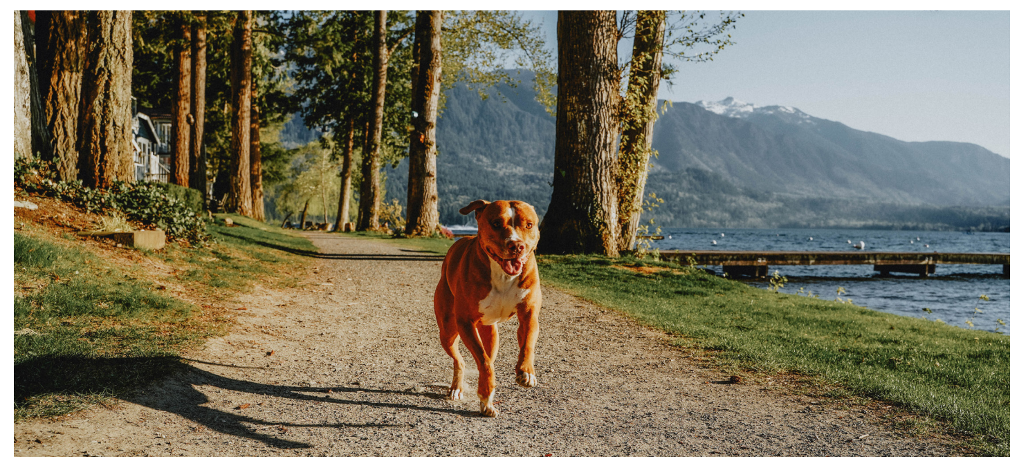
+ HR - launched Wellbeats wellness program to support employee health & wellbeing