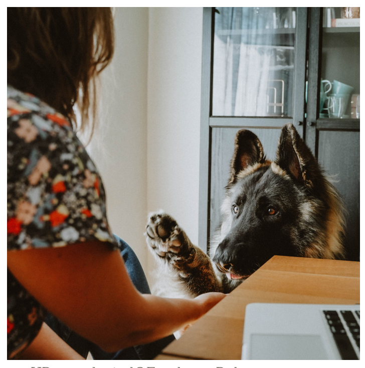
+ HR - conducted 2 Employee Pulse surveys