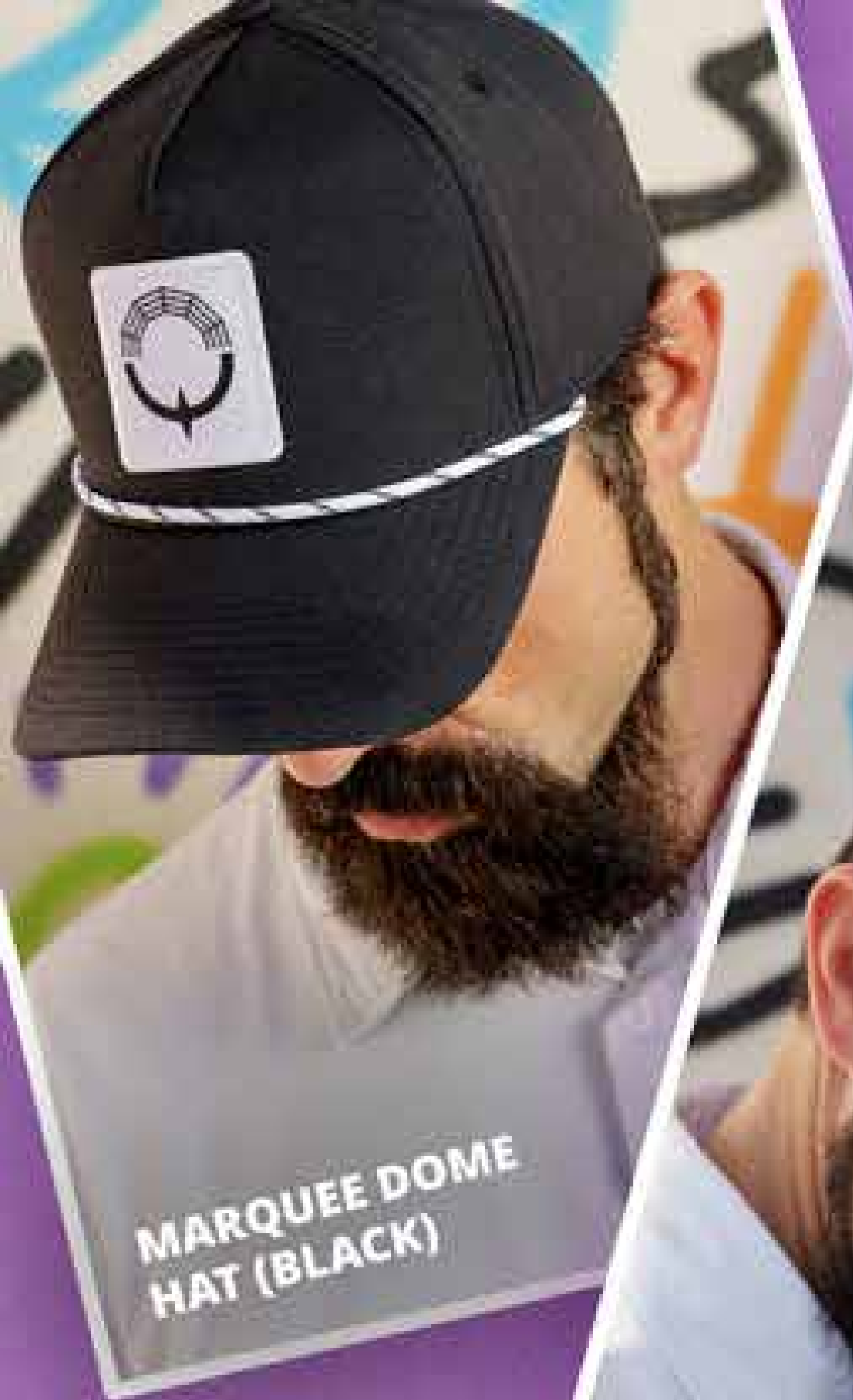
MARQUEE DOME HAT (BLACK)