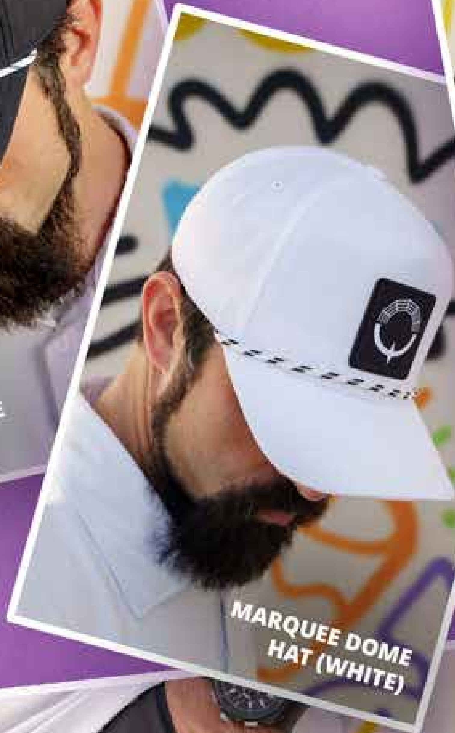
MARQUEE DOME HAT (WHITE)