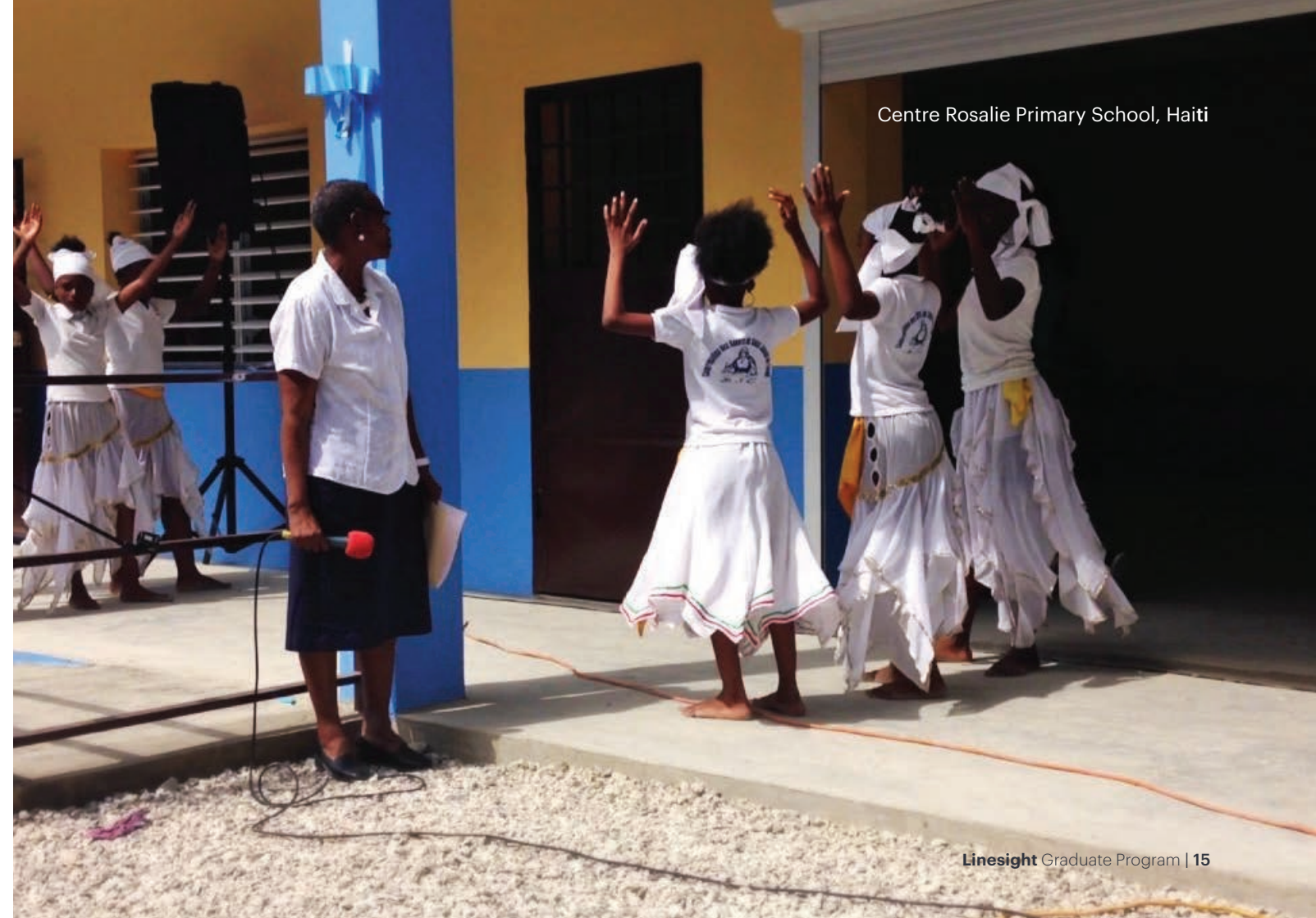
Centre Rosalie Primary School, Haiti