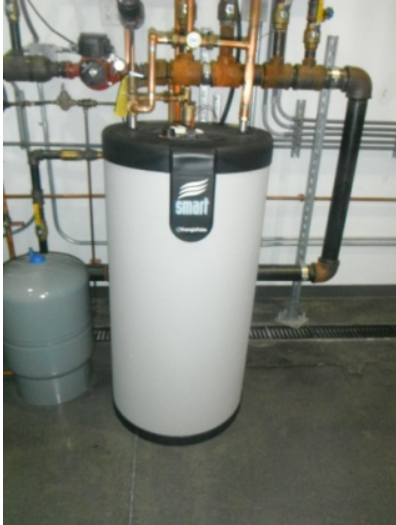
Overall photo of the SMART tank installation