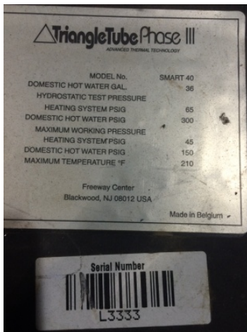
SMART tank rating label with Serial Number