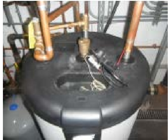
Top of the SMART tank showing connections and thermostat plate removed