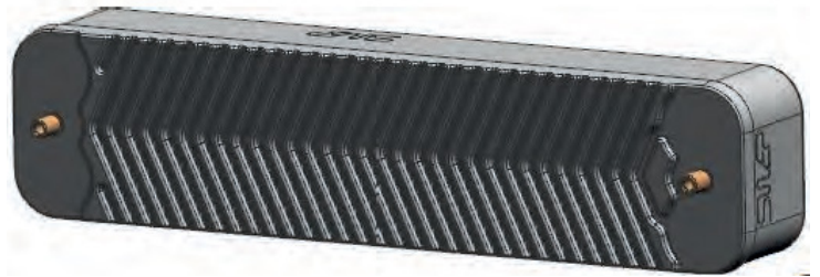
Fig. 1: Hydroblock