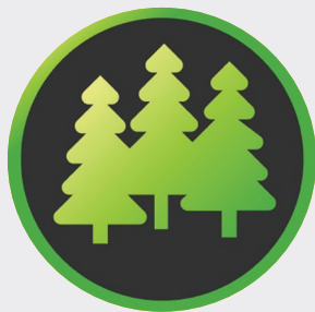
Environmental Assets (Offset Credits)

Veridium provides a platform and a set of protocols on which to onboard environmental assets to the Ethereum Blockchain, giving them a transparent pricing mechanism and liquidity. This additional utility, and the further development of the application layer, makes these assets the most efficient tool for mitigating the environmental impacts embedded in corporate supply-chains that ultimately pose an existential threat to shareholder value.