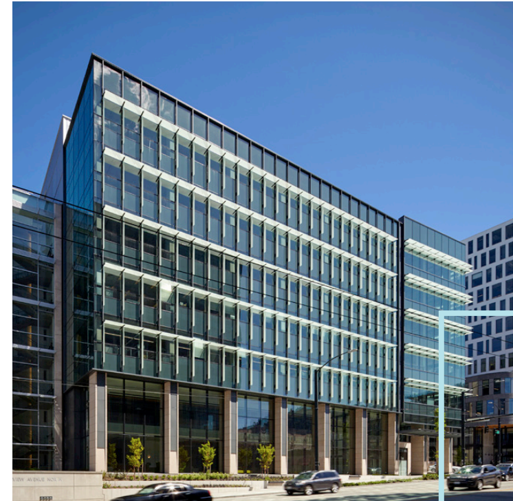
Vue Research Center, Seattle, WA