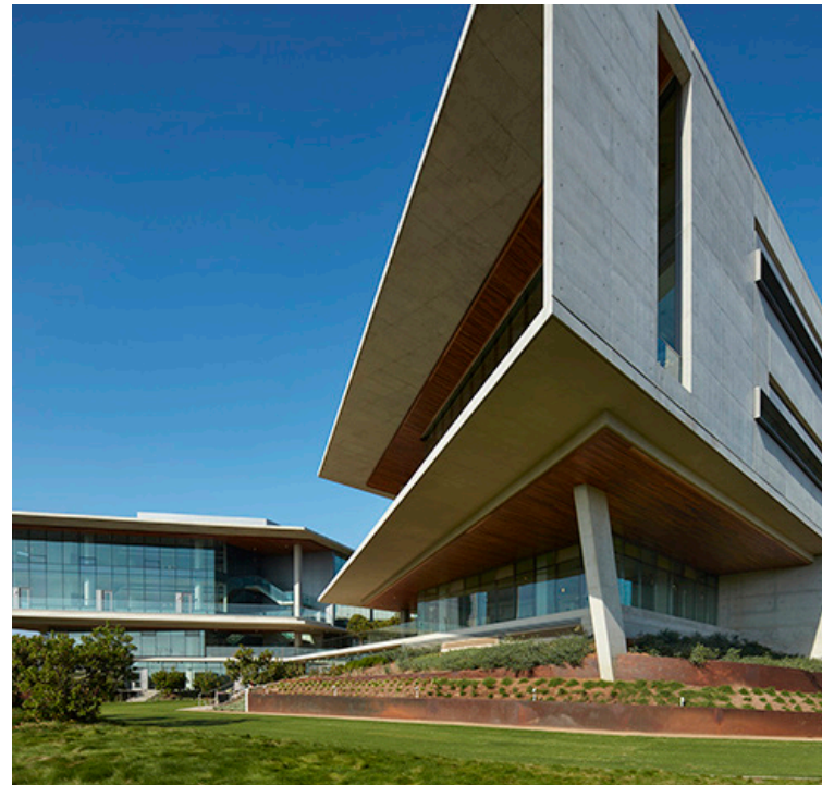
i3, San Diego, CA