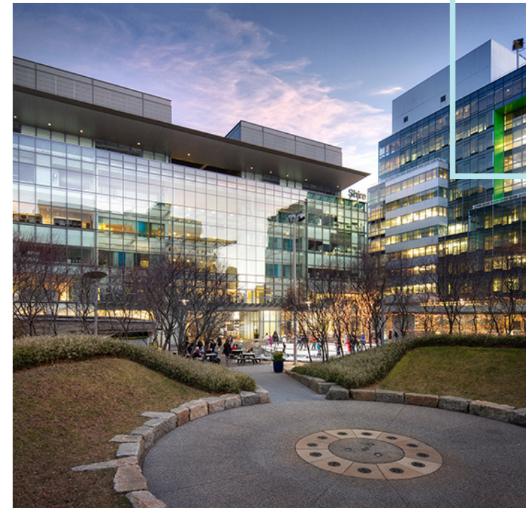
650 Kendall (left) & 500 Kendall (right), Cambridge, MA