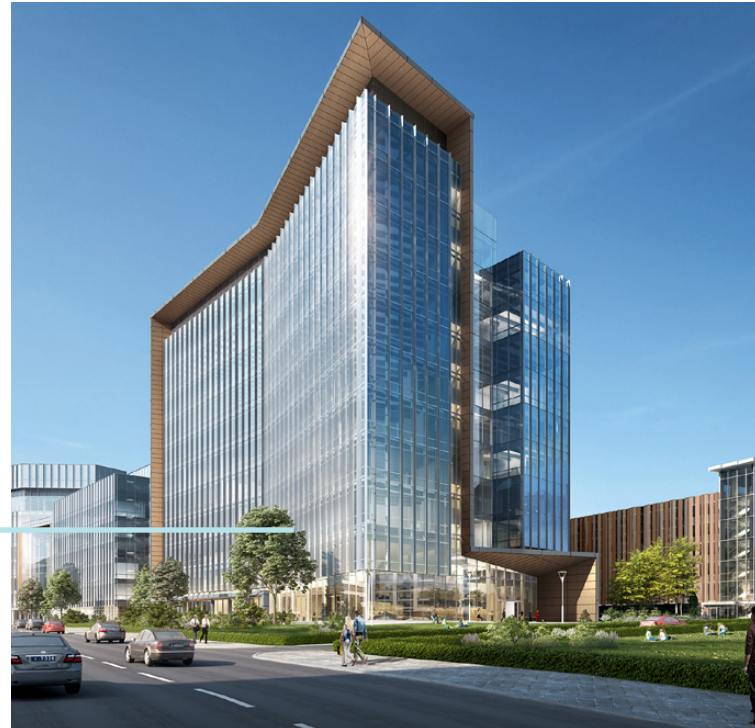
Gateway of Pacific, South San Francisco, CA

BioMed owns and operates high quality life science real estate comprising 15.5 million square feet concentrated in leading innovation markets throughout the United States and United Kingdom, including Boston/Cambridge, San Francisco, San Diego, Seattle, Boulder and Cambridge, U.K. In addition, BioMed maintains a premier development platform with 4.2 million square feet of Class A properties in active construction and 6.5 million square feet of future development platform to meet the growing demand of the life science industry.