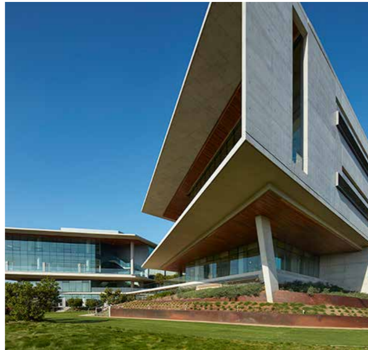
i3, San Diego, CA