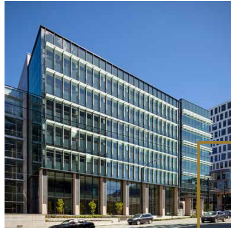
Vue Research Center, Seattle, WA