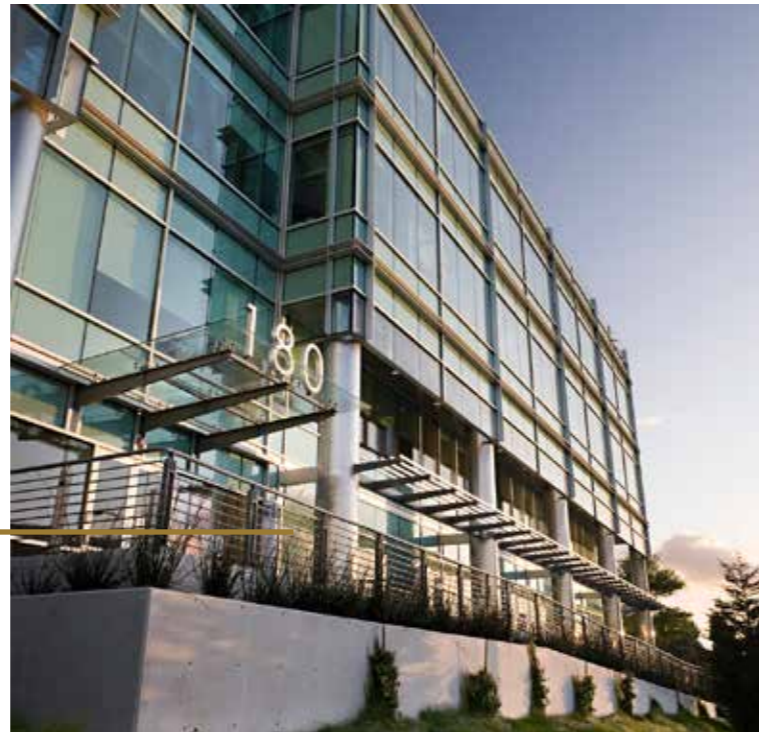
180 Oyster Point, South San Francisco, CA

In January 2016, BioMed Realty was acquired by affiliates of Blackstone Real Estate Partners VIII, which is part of Blackstone, one of the world's leading investment firms.