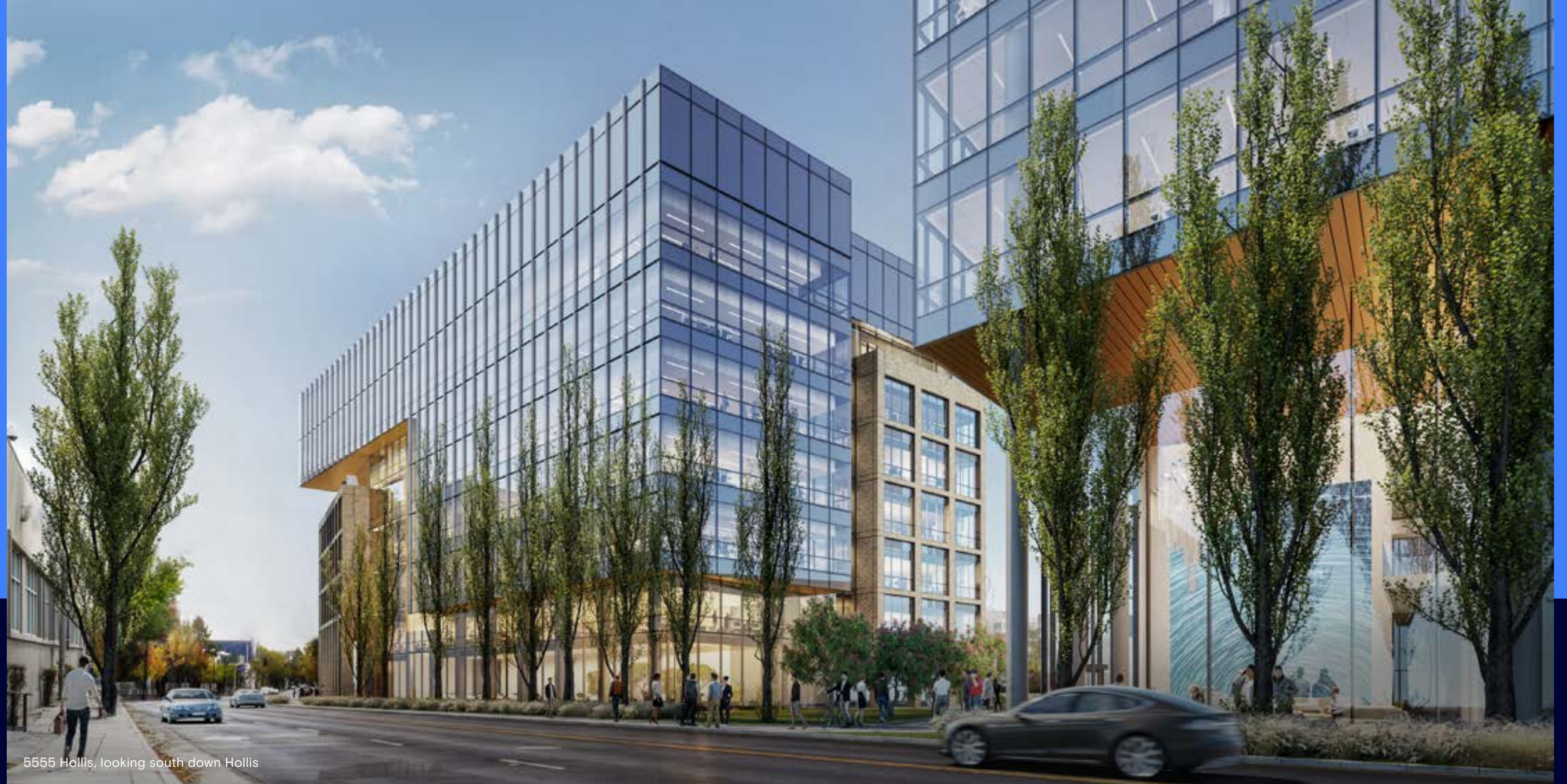
5555 Hollis, looking south down Hollis