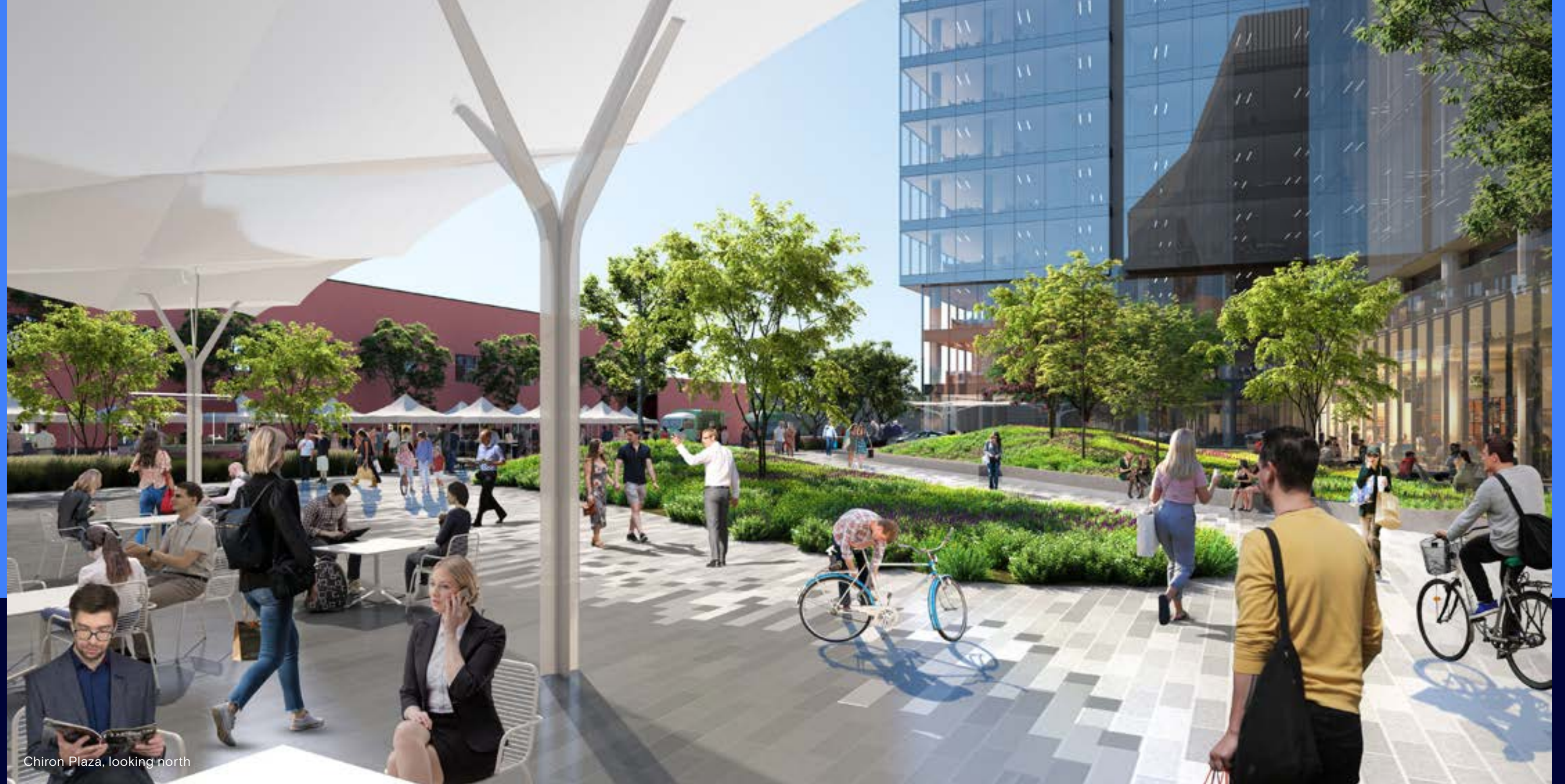
Chiron Plaza, looking north