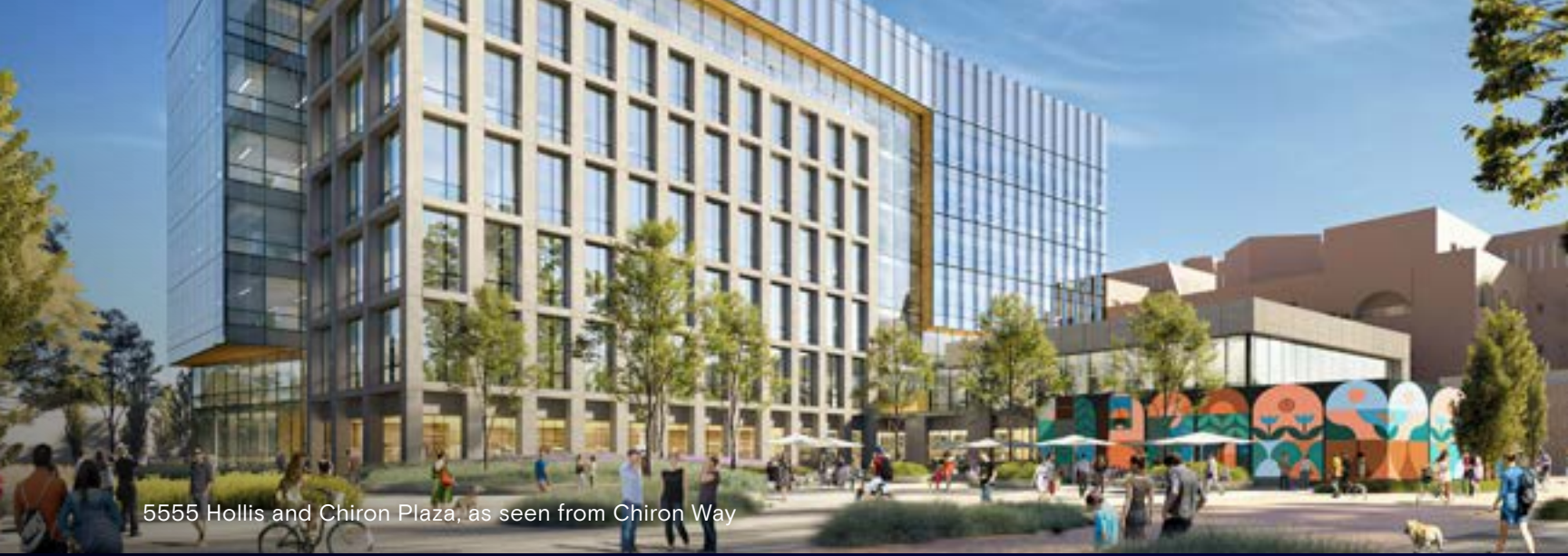
5555 Hollis and Chiron Plaza, as seen from Chiron Way