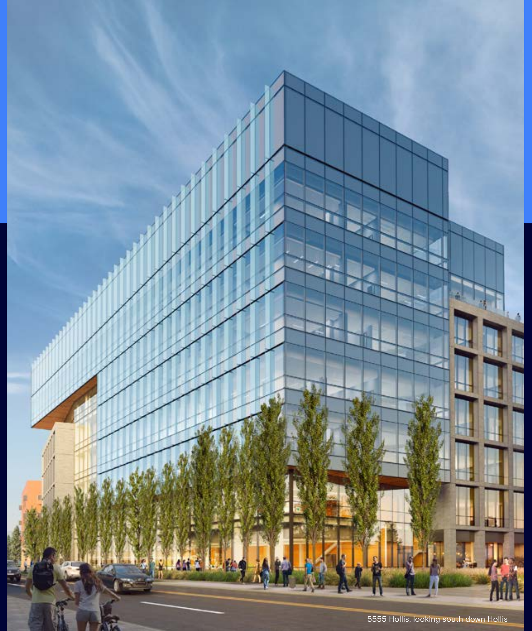
5555 Hollis, looking south down Hollis

Bay Size/Column Grid Spacing: Perimeter Bays: 21' x 42'-6" Center Bays: 21' x 33' Live Load (LL) = 100 PSF