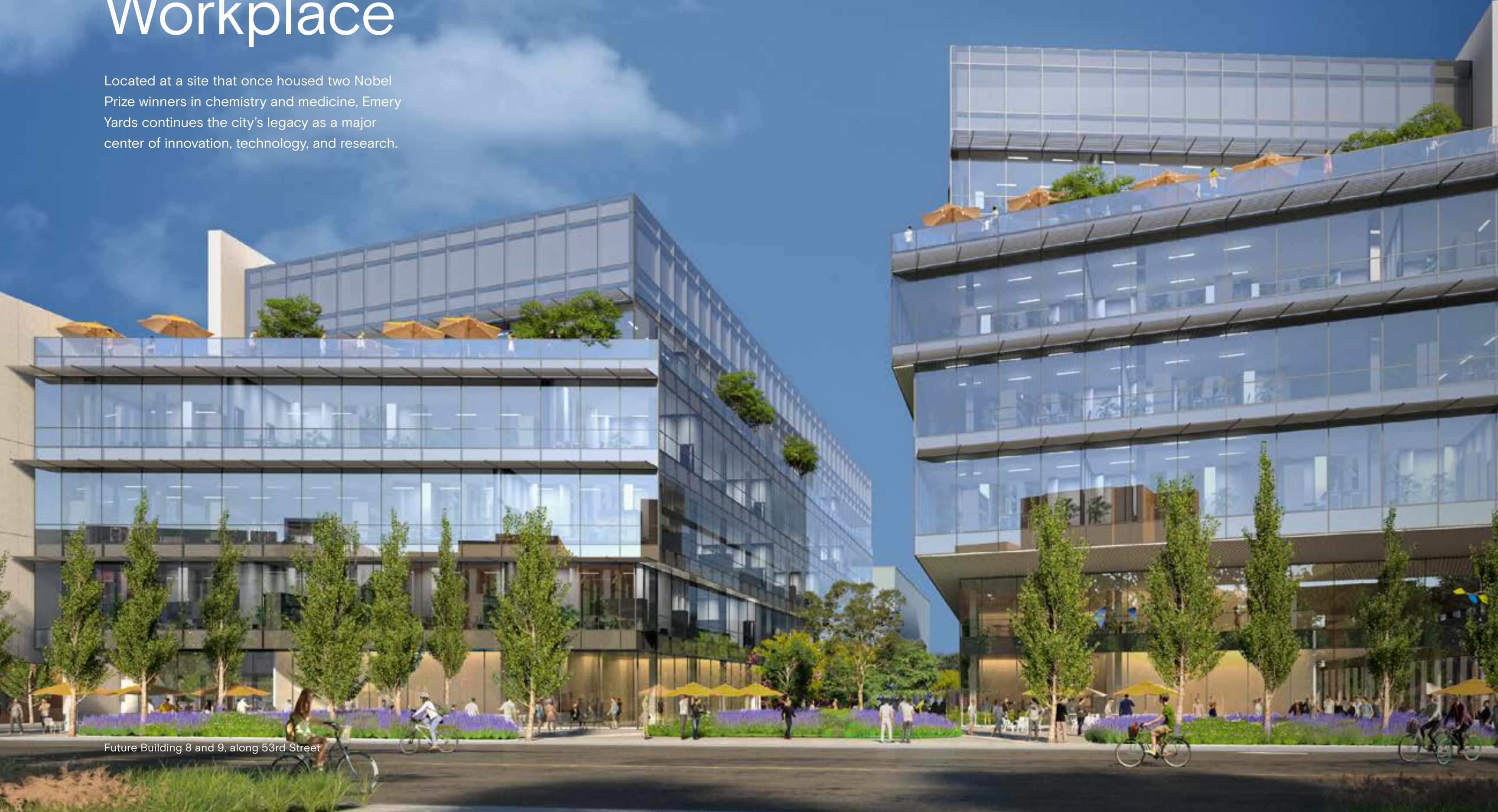
Future Building 8 and 9, along 53rd Street

Located at a site that once housed two Nobel Prize winners in chemistry and medicine, Emery Yards continues the city's legacy as a major center of innovation, technology, and research.