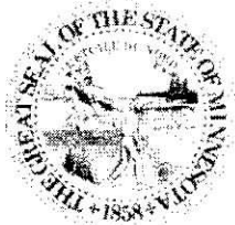
Maxwell Zappia, Deputy Commissioner

IN TESTIMONY WHEREOF, I have hereunto set my hand and affixed the official seal of the Department of Commerce, of the State of Minnesota at my office in the City of St. Paul, Minnesota, this 12th day of January, 2021.