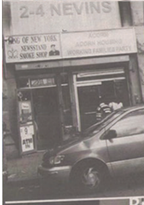
WALL OF SHAME: A secret video of ACORN's Brooklyn office (inset) shows a dry-erase board with forbidden political endorsements of Richard Aborn for Manhattan district attorney and Bill de Blasio for public advocate.