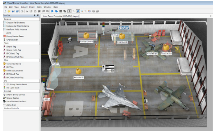
Visual Device Emulator (VDE)