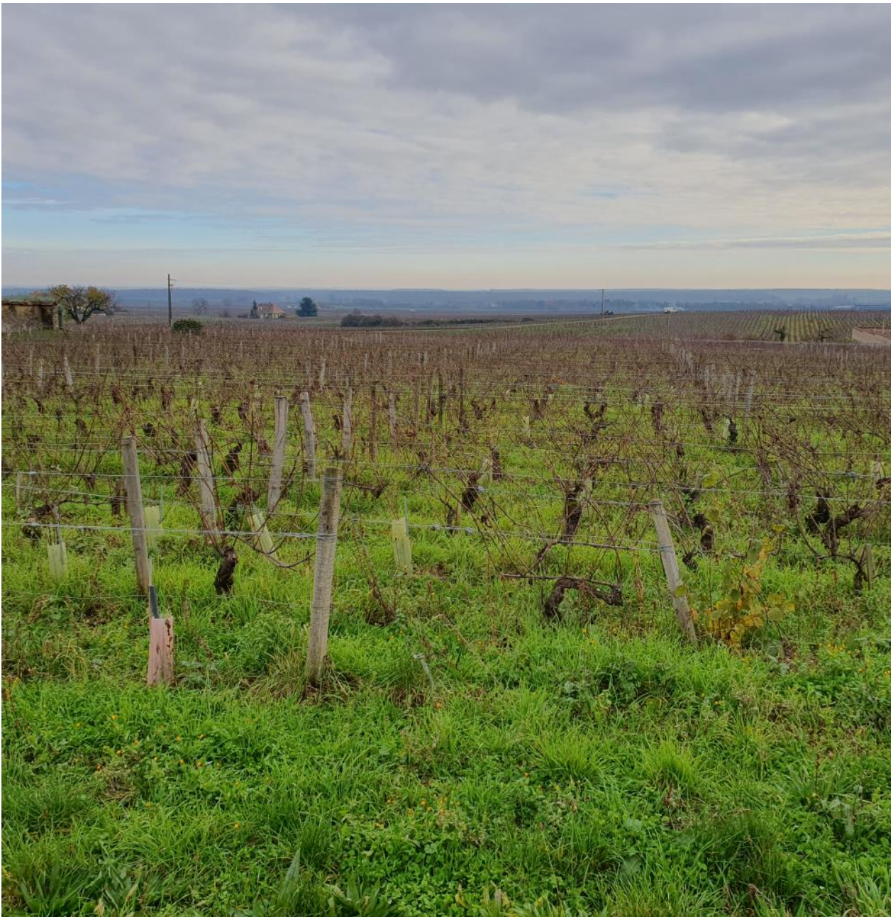
The view looking East from Domaine Felettig, Chambolle-Musigny.