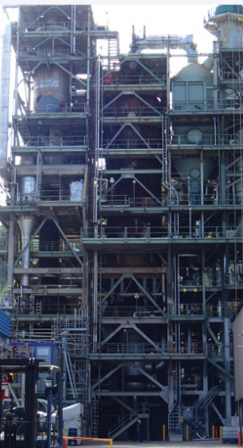
Burnaby Refinery's Fluid Catalytic Cracker (FCC)