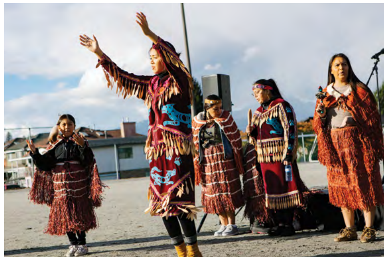
Parkland was honoured to have Tsatsu Stalqayu (Coastal Wolf Pack), a traditional Salish song and dance group perform at the Parkland Fun Day in the Park event.

We are proud of the steps we have taken to implement our Canadian Indigenous Strategy but recognize there is tremendous work still ahead. We have committed through the Canadian Aboriginal Business Council to PAR, the Progressive Aboriginal Relations program, which will help ensure we meet our objectives including building a diverse, welcoming and well-informed workplace.