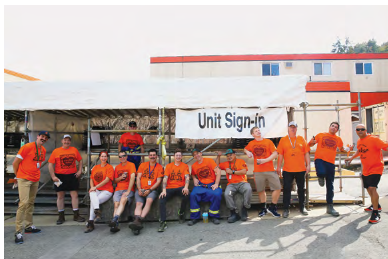
Parkland values opportunities to share in the cultural traditions of neighbouring Indigenous communities, and to participate in events such as Orange Shirt Day.