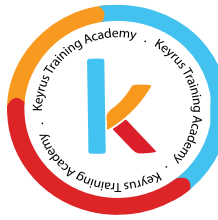
Tableau Training Course: VIEWER

This is a 1-day customised enablement training to familiarise Tableau Viewer users with the dashboards created for their specific departments and use cases. Each session will be customised to the content created for that user group. This training is designed to make use of existing client content that is pre-published to the client's Tableau environment. This ensures users learn using their data.