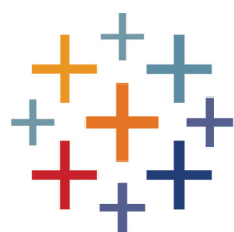
tableau ® TRAINING COURSES by keyrus

Enhance your team's capability to leverage the power of data through expert-led training courses