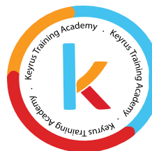
Tableau Combination Training Course: CREATOR

The combination course is designed and structured to guide delegates from beginner to advanced Tableau desktop users. This 3-day course is designed for Tableau Creators and is aligned to the Tableau Certified Data Analyst Exam preparation. Attendees will gain a thorough introduction to data analysis and visual design in Tableau. The second half of the course will expand on these foundational skills and distinguish attendees as Tableau power users.