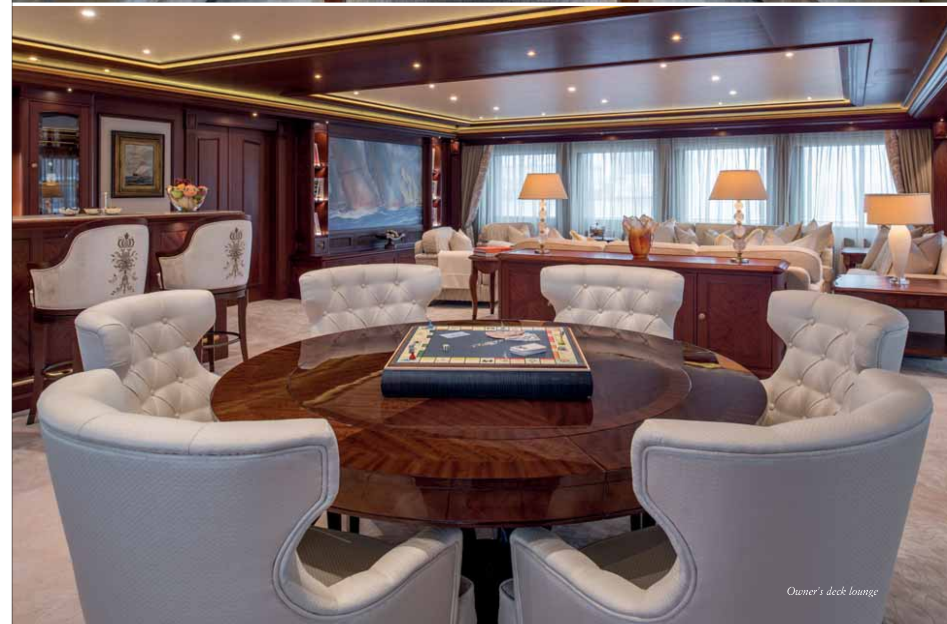
Owner's deck lounge