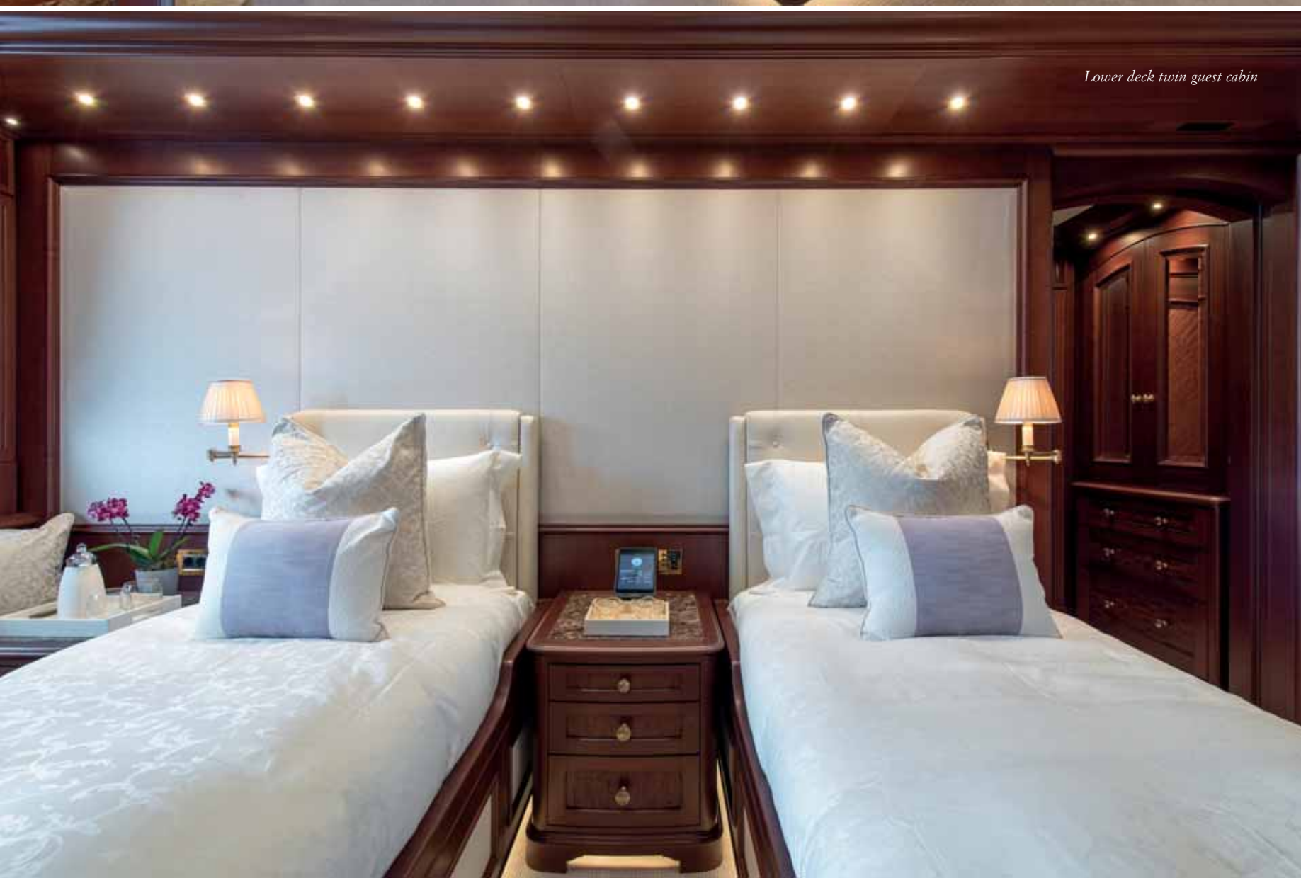
Lower deck twin guest cabin