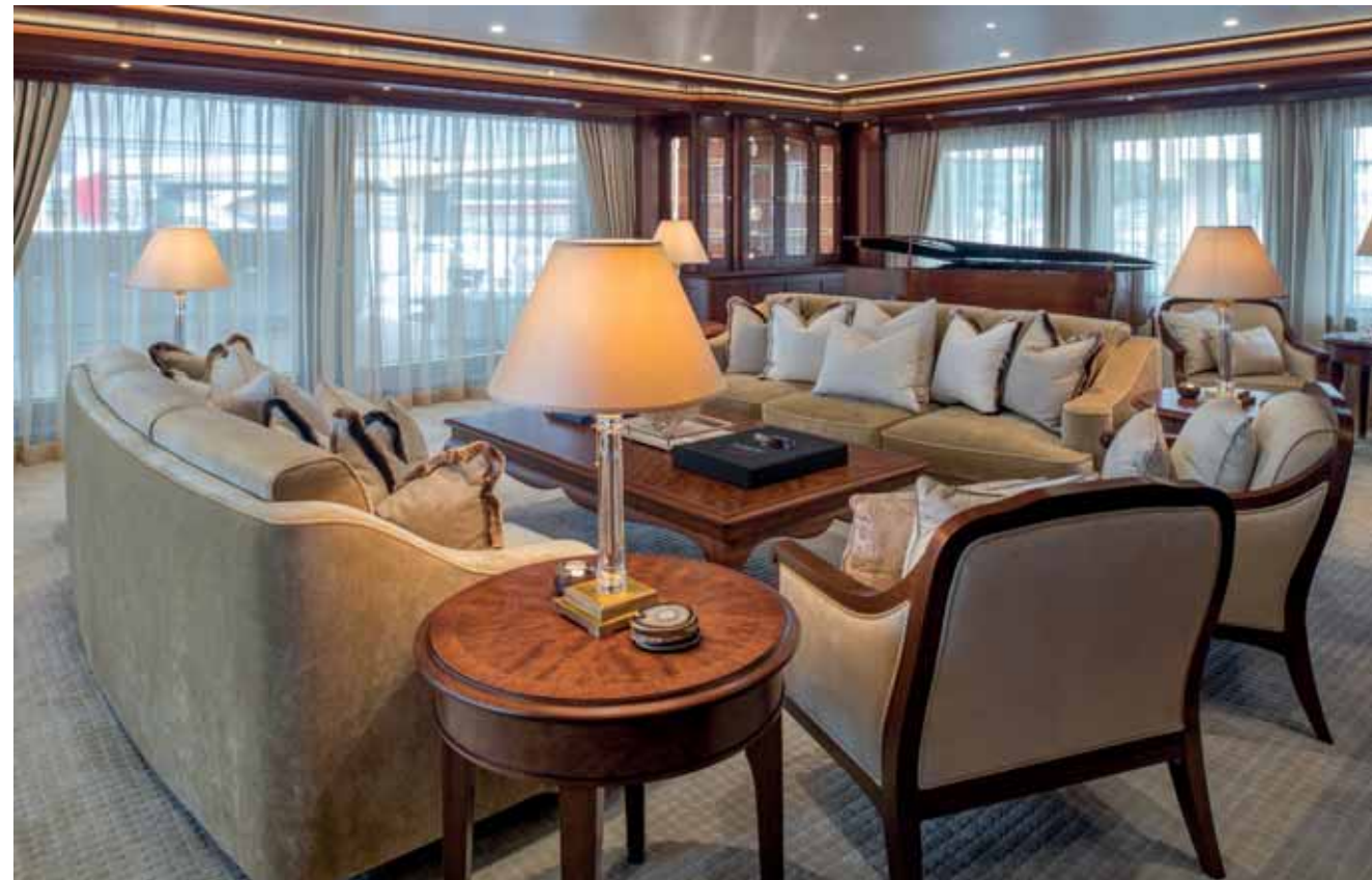
Main deck salon