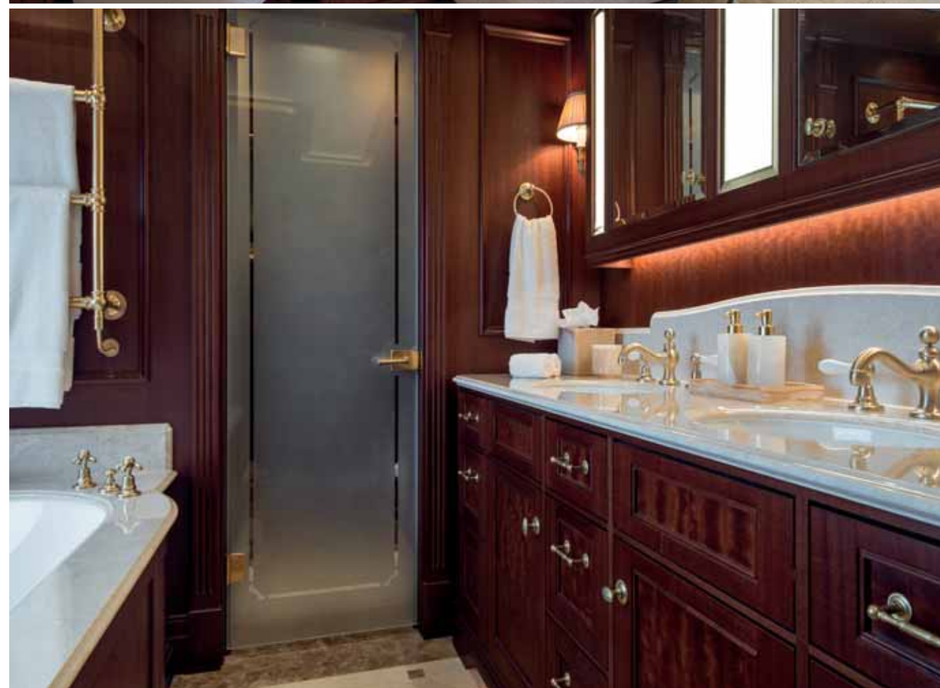
VIP Suite "Jade"