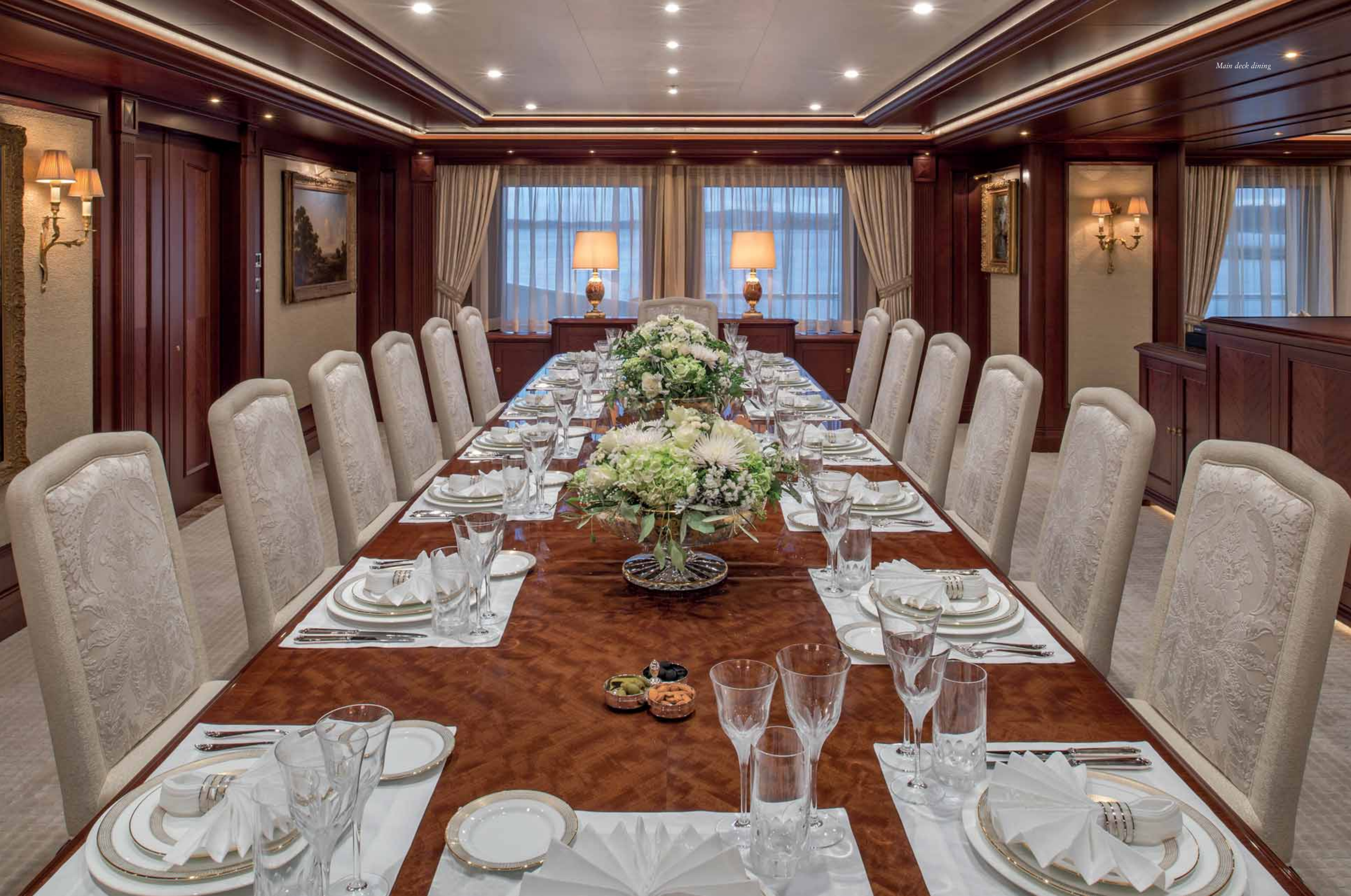
Main deck dining