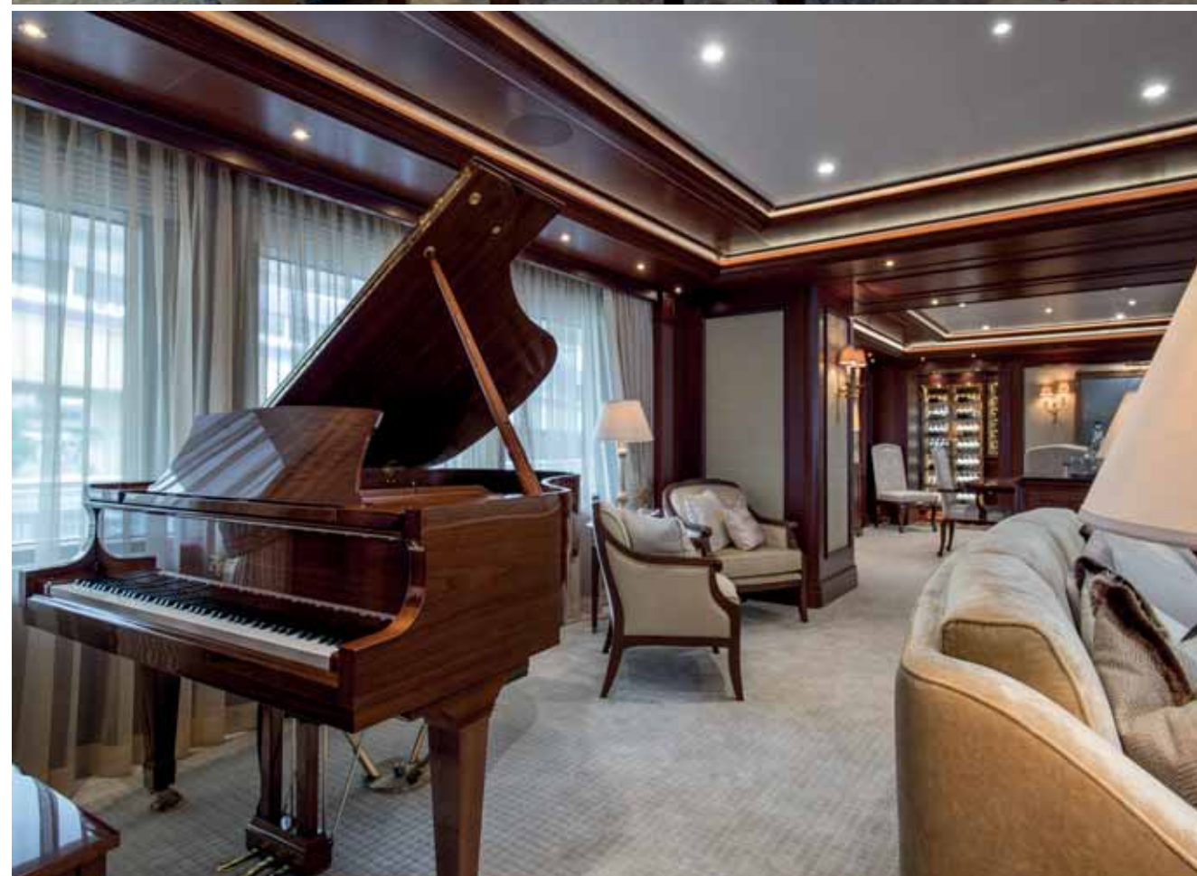
Main deck salon