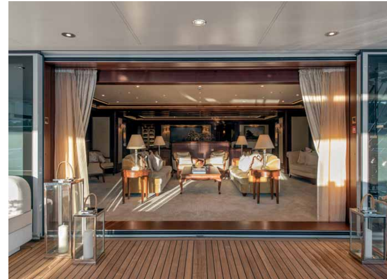
Main deck salon