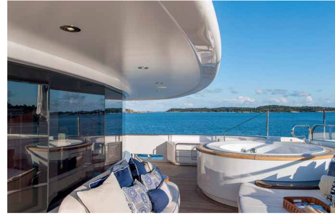
Owner's private deck