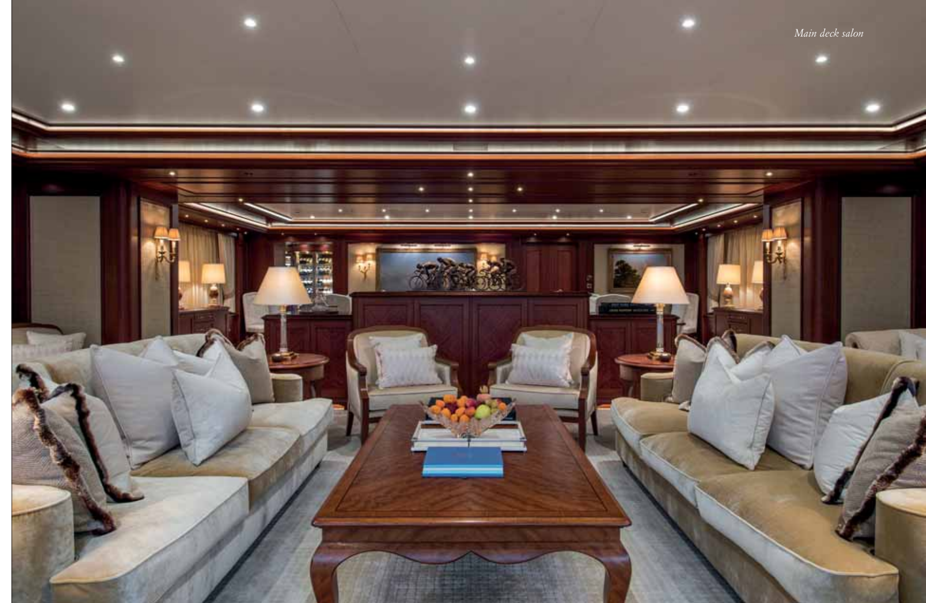
Main deck salon