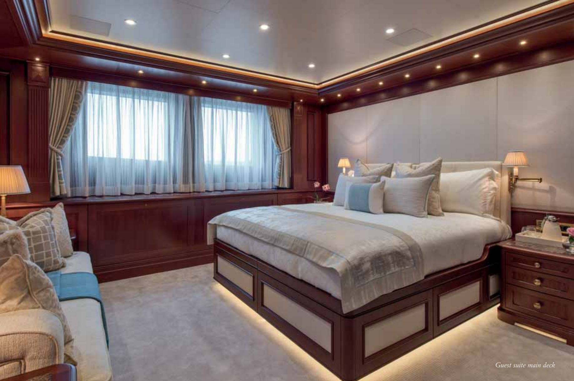
Guest suite main deck