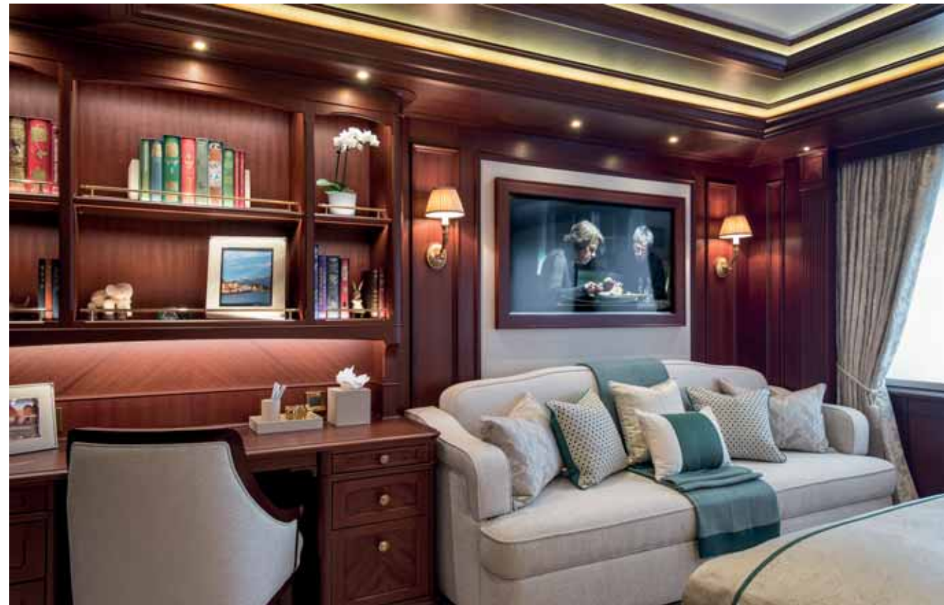
VIP Suite "Jade"