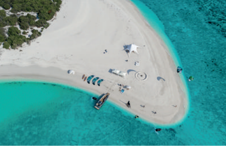
Day trips can be arranged to picture-perfect islands and beaches, and feature a range of watersports including kite-surfing

treatments of all varieties, medical personnel, aviation, hospitality service, chefs and fine dining.