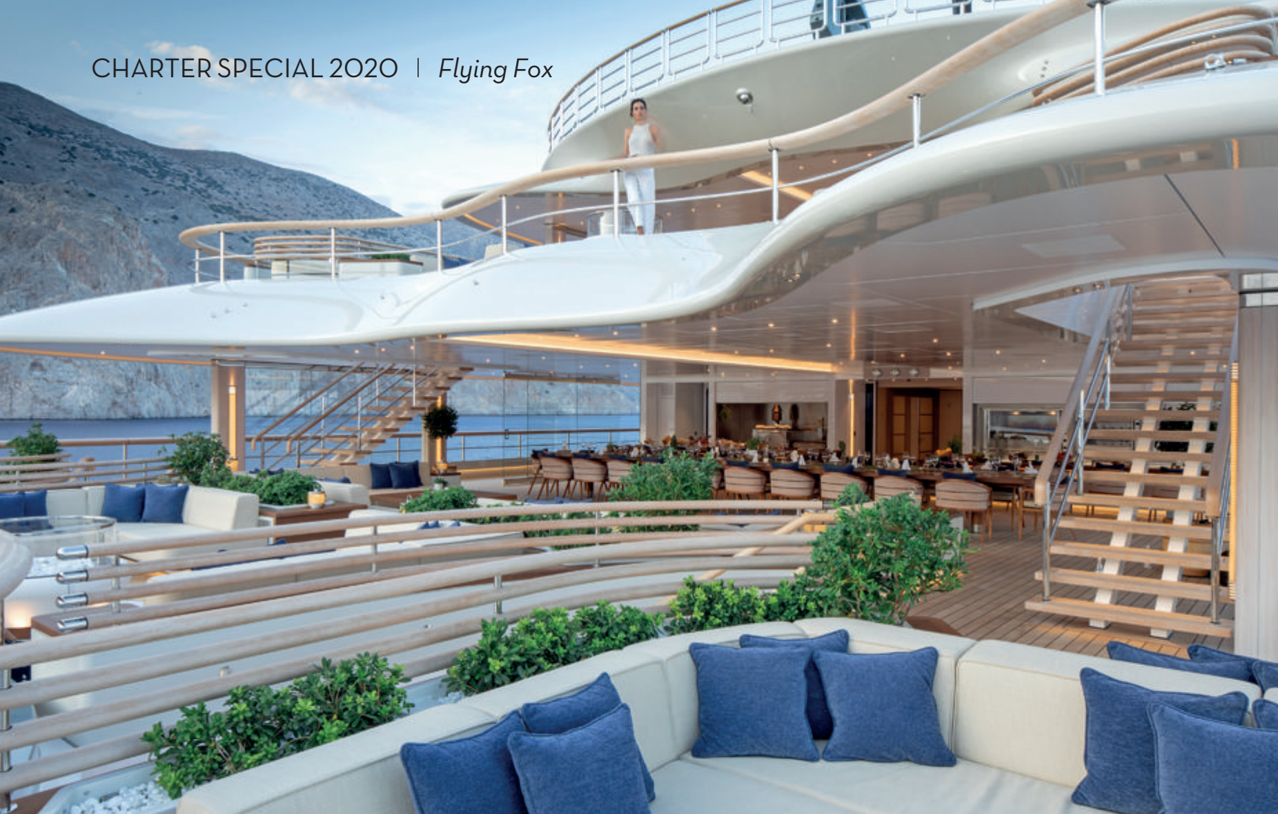
The aft bridge deck and owner's deck can be protected by sliding glass 'windbreakers' on both sides

With heated limestone floors and louvred oak panelling, the spa's centrepiece is a vast spa pool, with water that can be changed from steaming hot to icy cold in about 10 minutes. It's ideal as a plunge pool following time in the Turkish hammam or Finnish sauna, while there's even a cryotherapy chamber, the first installed on a superyacht and a firm favourite with charter clients. On the floor above, the spa lobby leads to separate rooms for dry and wet massages, and a three-station beauty salon offering hair and skin treatments, manicures and pedicures. "Guests rate the spa as good as if not better than the best you can find ashore," Stewart remarks.