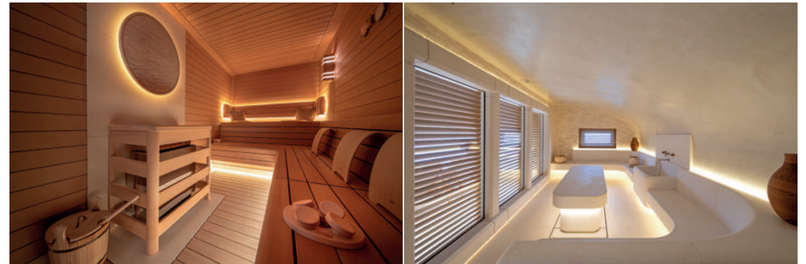
After water sports, the spa offers R&R in the Finnish sauna (left), Turkish hammam (right) and cryotherapy chamber (bottom)

Fox . If a guest wants the aft deck to face the sun all day, we can set the DP to track the sun for that perfect tan," says the Captain, who adds that the system also opens up cruising areas by allowing access to non-anchoring zones that other vessels may not be permitted to enter.