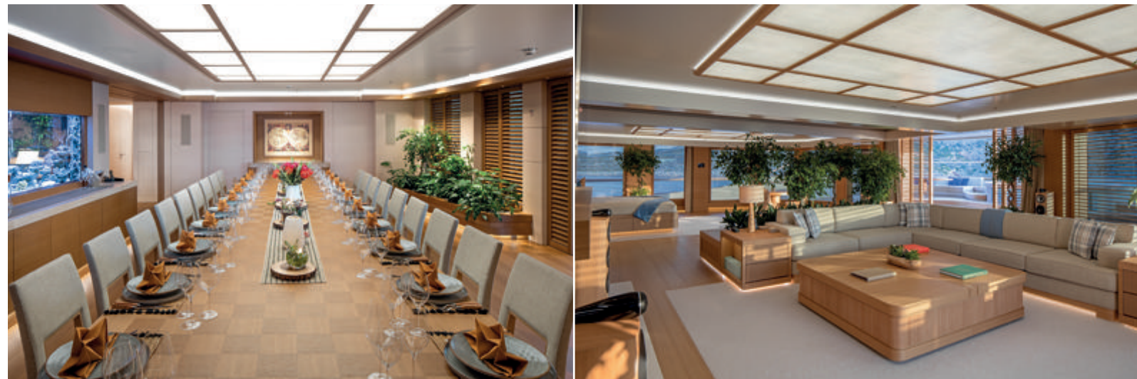
The 22-seat dining table by the saloon on the bridge deck; natural wood and greenery dominate the zen-like interior

"Despite her massive size, flexibility is the real strength of Flying