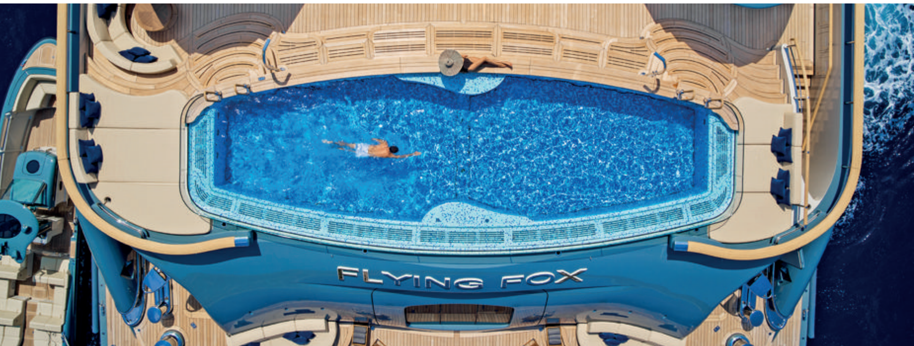
The 12m transverse pool is a feature of the two-deck spa and wellness area spanning the aft main and lower decks

“The world’s most experienced charter guests were demanding this kind of once-in-a-lifetime opportunity.”