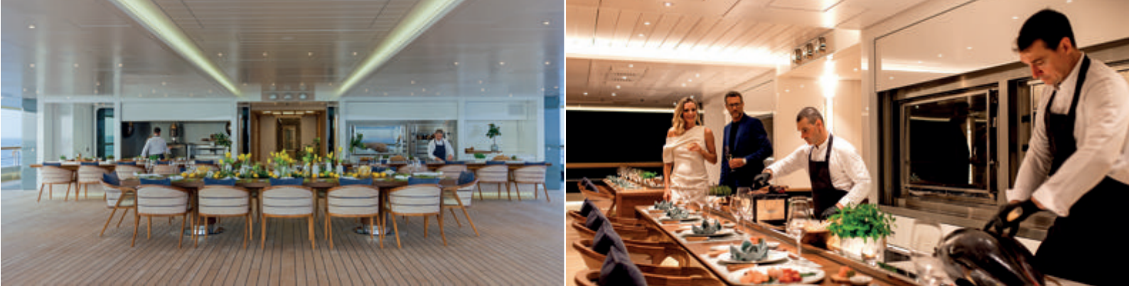
The covered dining area can seat up to 24 guests; the exterior galley offers Teppanyaki, barbecue, rotisserie, tandoori, a pizza oven and two bars

Early this year, we were expecting an excellent charter season for Flying Fox in the Maldives and the Indian Ocean before the global spread of Covid-19. We anticipated the crisis by stopping any crew rotation before the pandemic affected the Indian Ocean and distancing the crew from exterior contacts. All crew on board were safe before and during the crisis. During the peak of the pandemic, we noted an increase in charter enquiries, for an obvious reason: Flying Fox is one of the safest vessels, with a full-time medic on board and a clean environment. Crew rotation is only scheduled to restart once the global situation stabilises. It's a huge effort for all involved, from crew to management teams, but necessary to ensure the safety of all aboard and the cleanliness of the vessel. We can assure future charter guests on Flying Fox that she remains a very safe environment and hope her next trip to the Indian Ocean will be as successful as the first journey promised to be. Julia Stewart, Director, Imperial