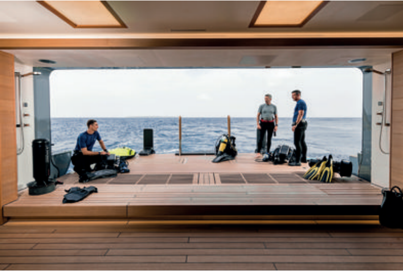
A stunning watersports and dive centre has its own drop-down platform that can also serve the yacht’s many tenders

“Guests often demand new sensations that only secluded areas can offer,” she says. “The Caribbean is a busy place, but in Asia, there are so many areas, lagoons, islands and archipelagos to be explored. It’s like an unlimited playground.”