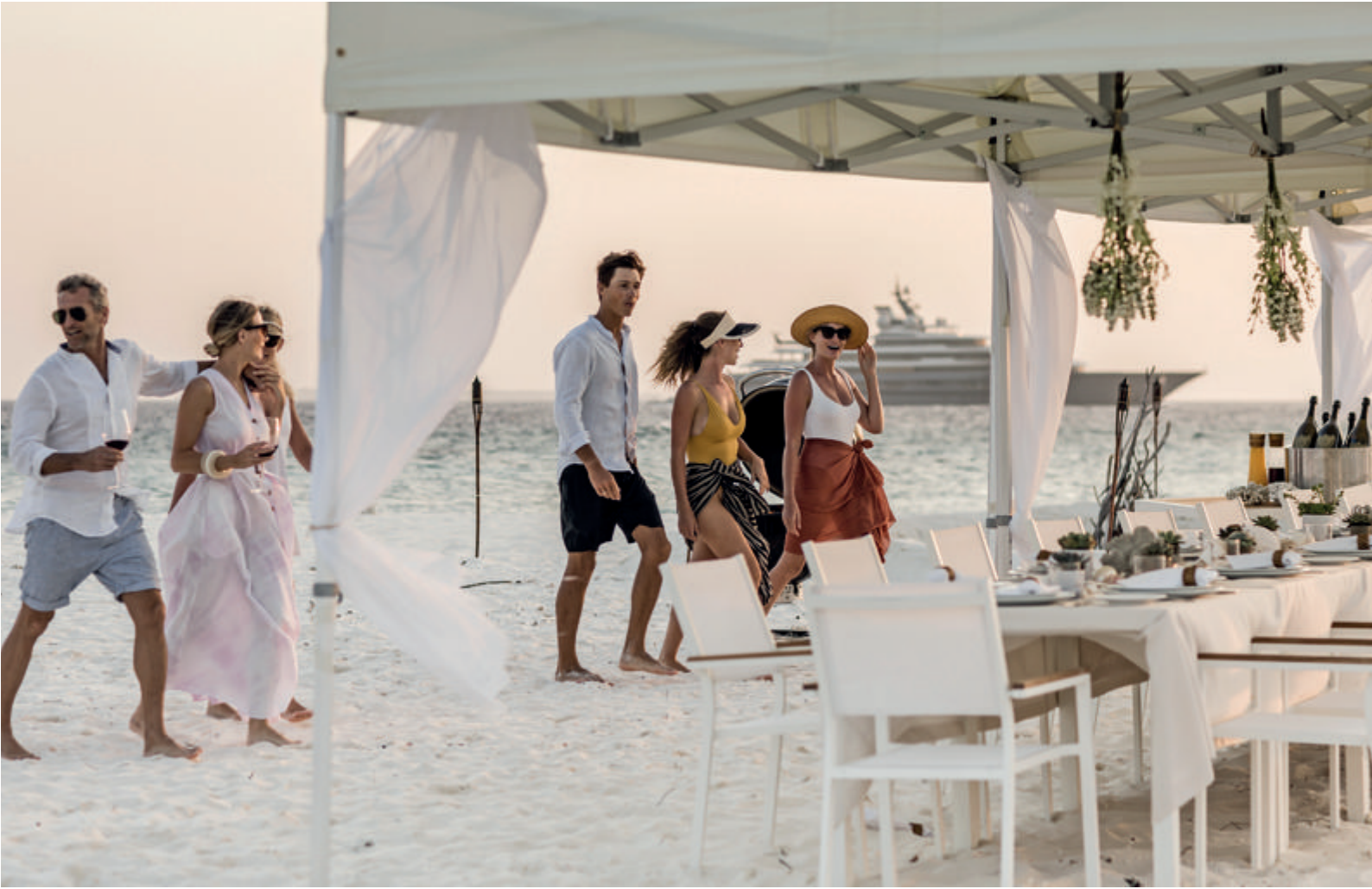
Barbecues and covered dining can be arranged on the beach, whether for large parties or a couple

“ Flying Fox is like a home at sea,” Stewart says. “The warm, zen-like interior gives a really comfortable atmosphere where everybody can feel relaxed. The wood, trees and plants everywhere help you to