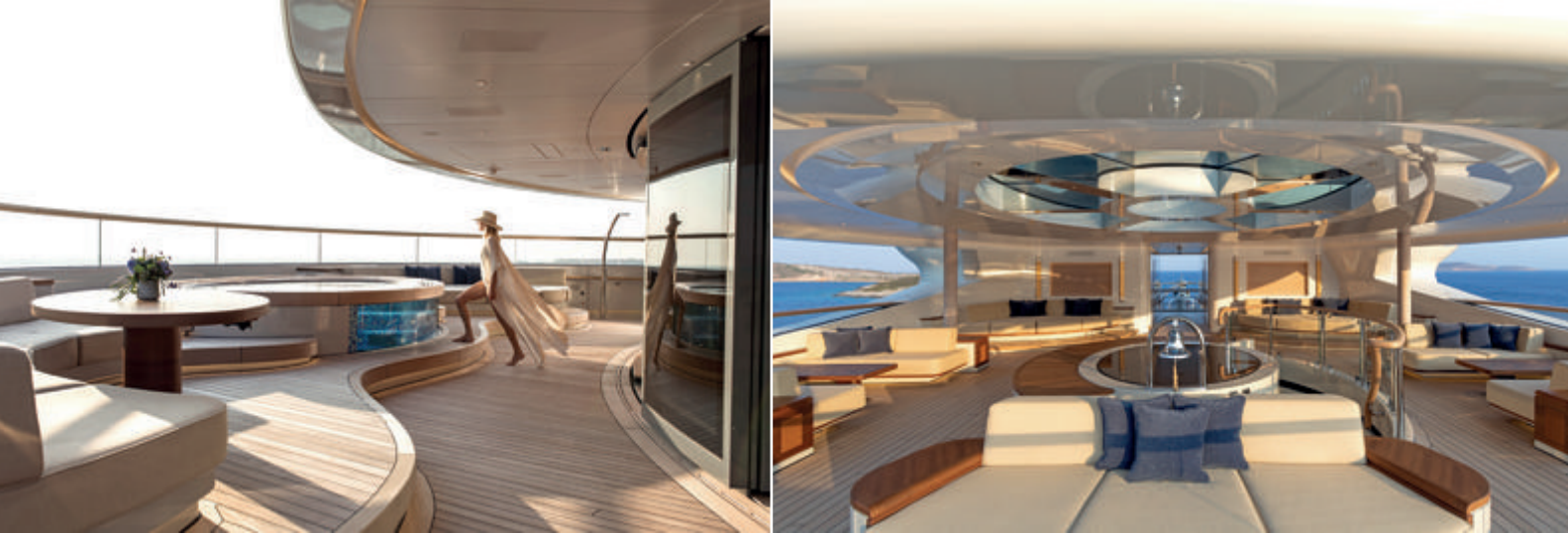
The owner's deck and sun deck each feature a forward jacuzzi; a cosy observation deck sits above the sun deck – see the helicopter through the hallway

most popular dining area is on the aft bridge deck, where chefs at the exterior galley cook for up to 24 seated diners. This showpiece cooking zone is fun for guests and a delight for chefs, whose hardware includes a Teppanyaki grill, tandoor oven, Josper charcoal grill, full-size rotisserie and pizza oven. "The exterior galley is the favourite area of all guests," Stewart says. "It's the perfect social area to relax, socialise, drink and dine at the end of a busy day at sea. It's great to relax at the bar and watch the galley brigade creating exceptional dishes of your choice." Ensuring guests from every part of the world are catered for and provided with the meals they want, clients complete a comprehensive document prior to boarding that covers all dietary requirements and desired cuisine.