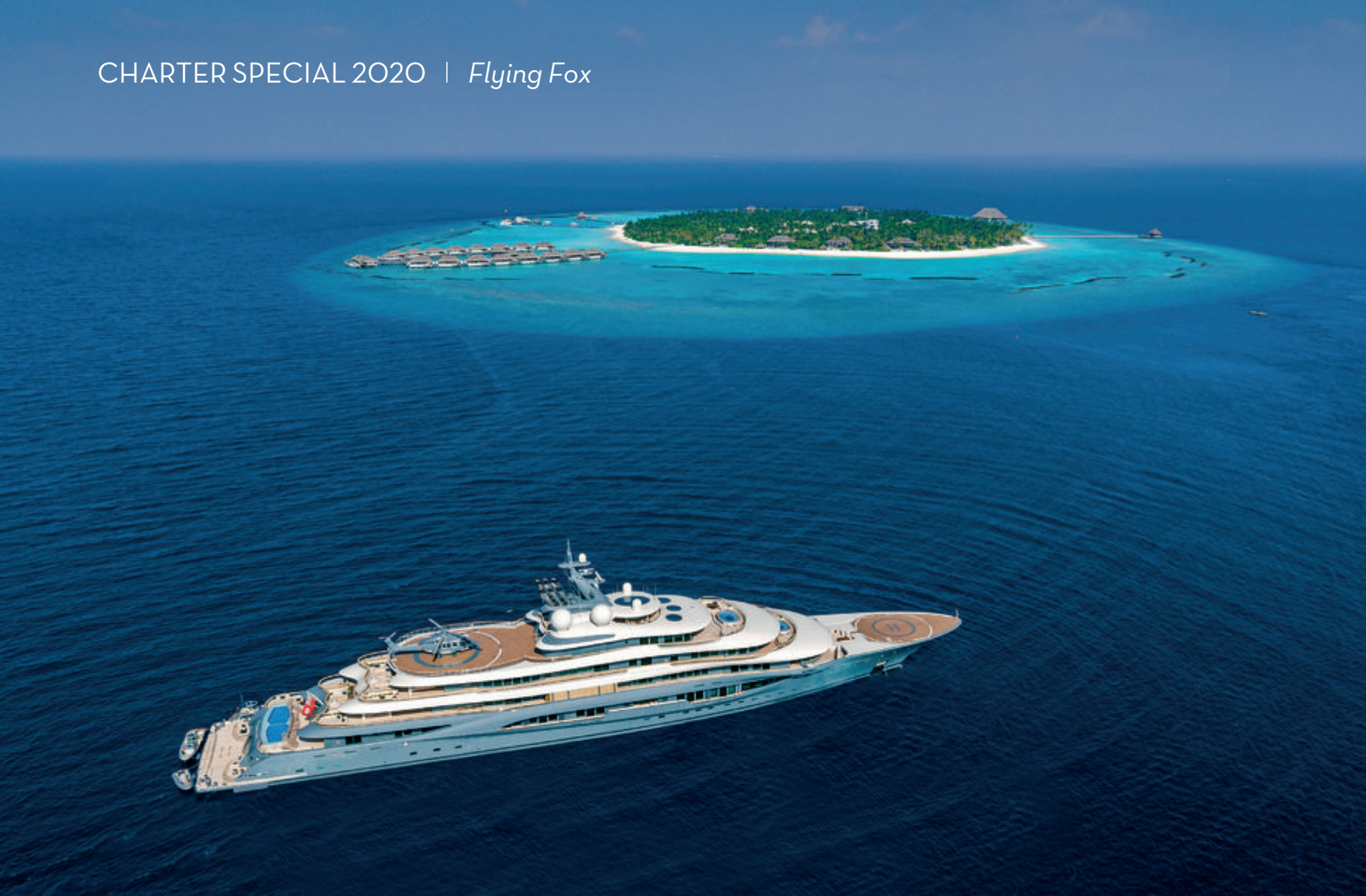
Flying Fox, pictured by Velaa Private Island, visited the Maldives in early 2020 and will return to Asia later this year for its second winter charter season

Currently in the Mediterranean for her second summer season, Flying Fox is scheduled later this year to return to Asia, where she already has charter bookings. It will be her second stint in the region, having spent time in the Maldives during an Indian Ocean cruise earlier this year for her winter charter season, which was eventually halted due to Covid-19 ( see box ).