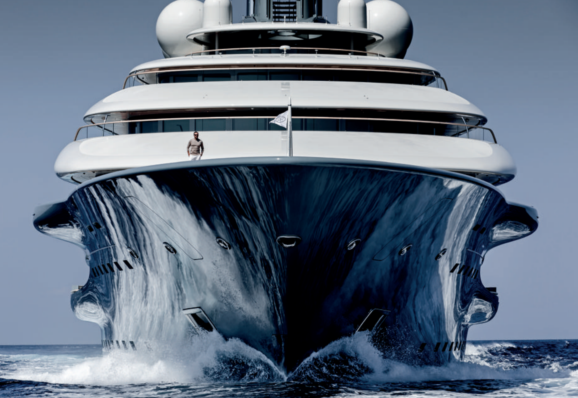
Designed by Espen Oeino, Flying Fox features a curvy superstructure and protruding side decks on its dove-grey hull

The 136m Flying Fox presents an otherworldly charter experience, with the kind of choices you can only dream of having. For starters, if you decide to fly to the world's largest charter yacht, there's the question of which helipad you want to land on.