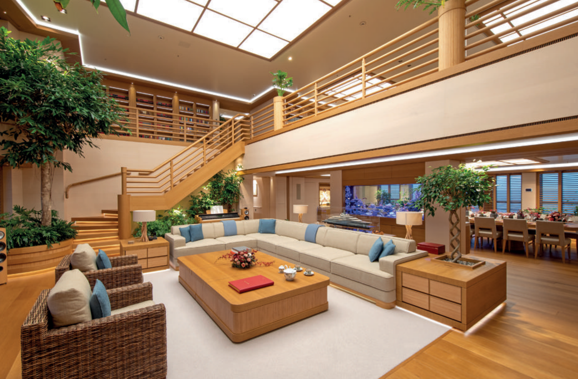
Spanning the bridge deck and owner's deck (top), the saloon has a maxi TV and is separated from the dining table by an artificial coral aquarium

breathe deeply, to really feel like you're now out of the madness of the outside world. It's a unique, agreeable feeling."