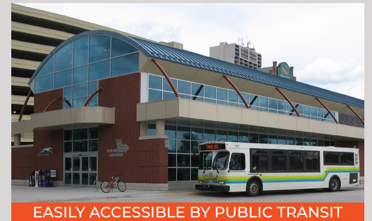
EASILY ACCESSIBLE BY PUBLIC TRANSIT