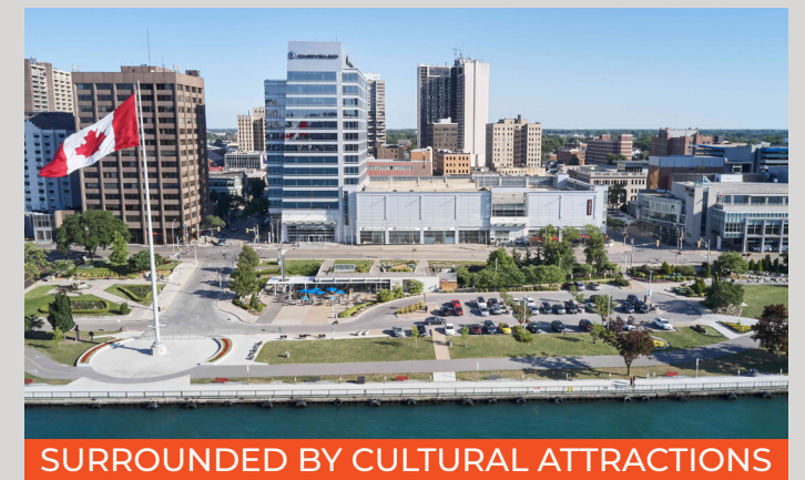
SURROUNDED BY CULTURAL ATTRACTIONS