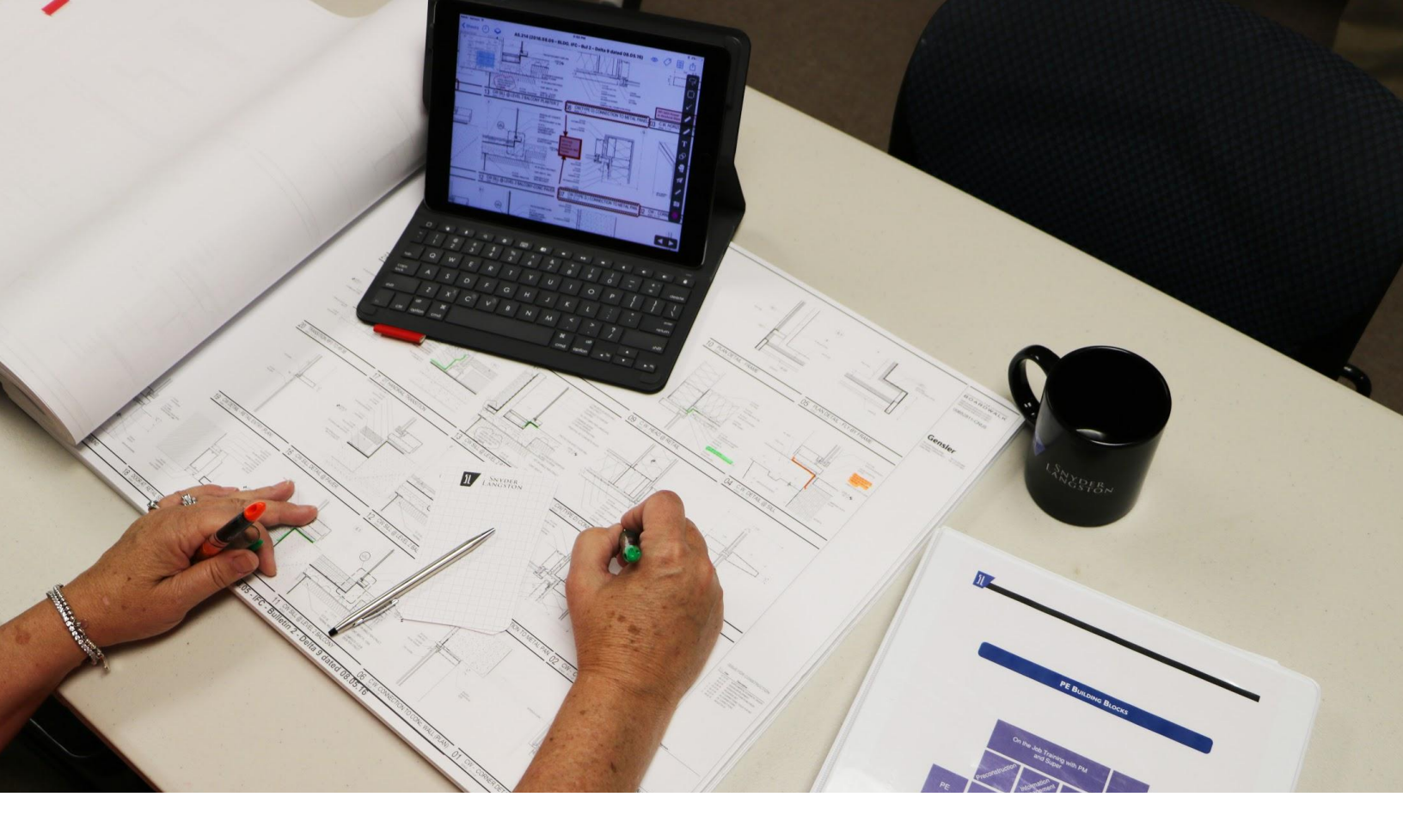
"PlanGrid is how we ensure our subcontractors are working off the most accurate set of plans and have access to all of the RFI's and submittals."