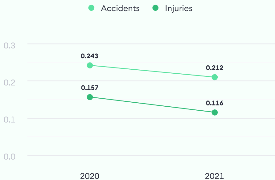
Accidents and injuries per 10,000 rides