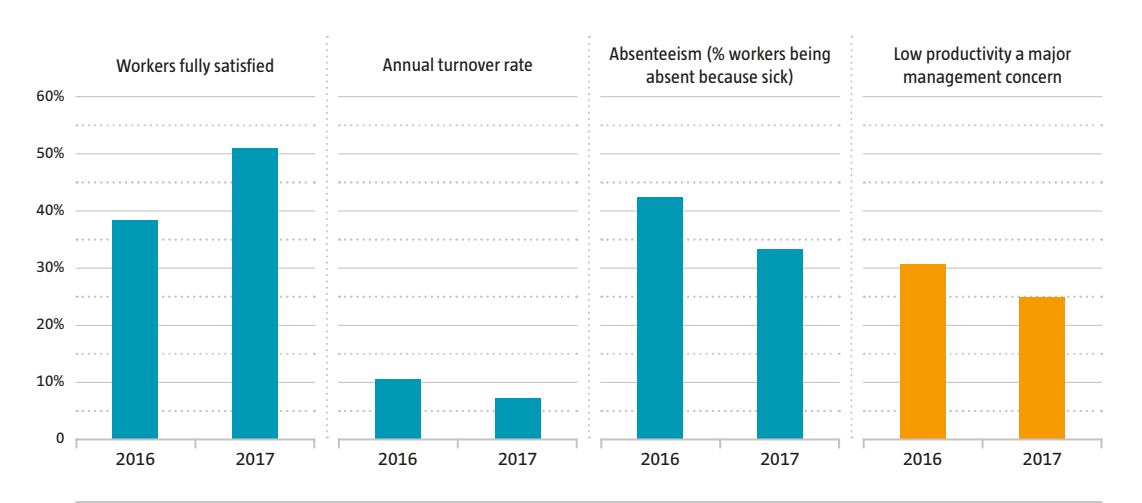
Figure 5: Fair Wages Makes Happier Workers

The results of a one-year fair wage remediation program covering 81 suppliers of a major global brand. After fair wages implemented, employers reported higher rates of worker satisfaction, lower absenteeism and employee turnover; and managers themselves worried less about overall productivity.