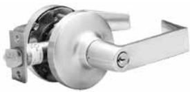
ENTRY ENTRANCE/OFFICE INSIDE TURN BUTTON