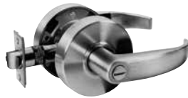
PRIVACY RESTROOM INSIDE PUSH BUTTON