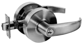
ENTRY ENTRANCE/OFFICE INSIDE TURN BUTTON