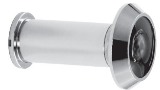
180° UL DOOR VIEWER