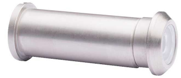
160° UL DOOR VIEWER