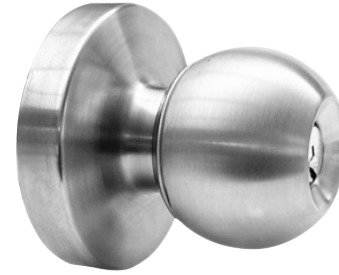
BALL KNOB TRIM