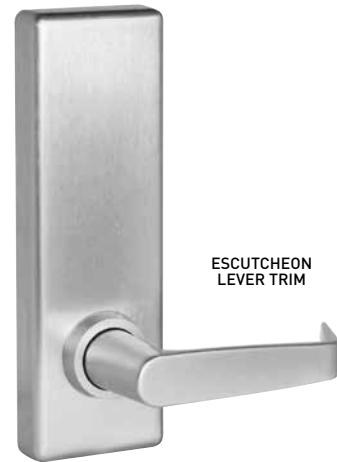
ESCUTCHEON LEVER TRIM