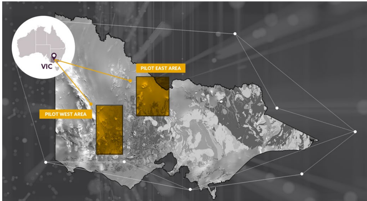
Figure 3: Proposed pilot project areas, Victoria, Australia

During the quarter, SensOre commenced a pilot project for Victoria, targeting gold with alliance partner Intrepid Geophysics. The collaboration aims to expand SensOre's geophysical targeting capabilities in 'under cover' exploration areas and recognises Intrepid Geophysics' leading position in data and analytics in this field over several decades.