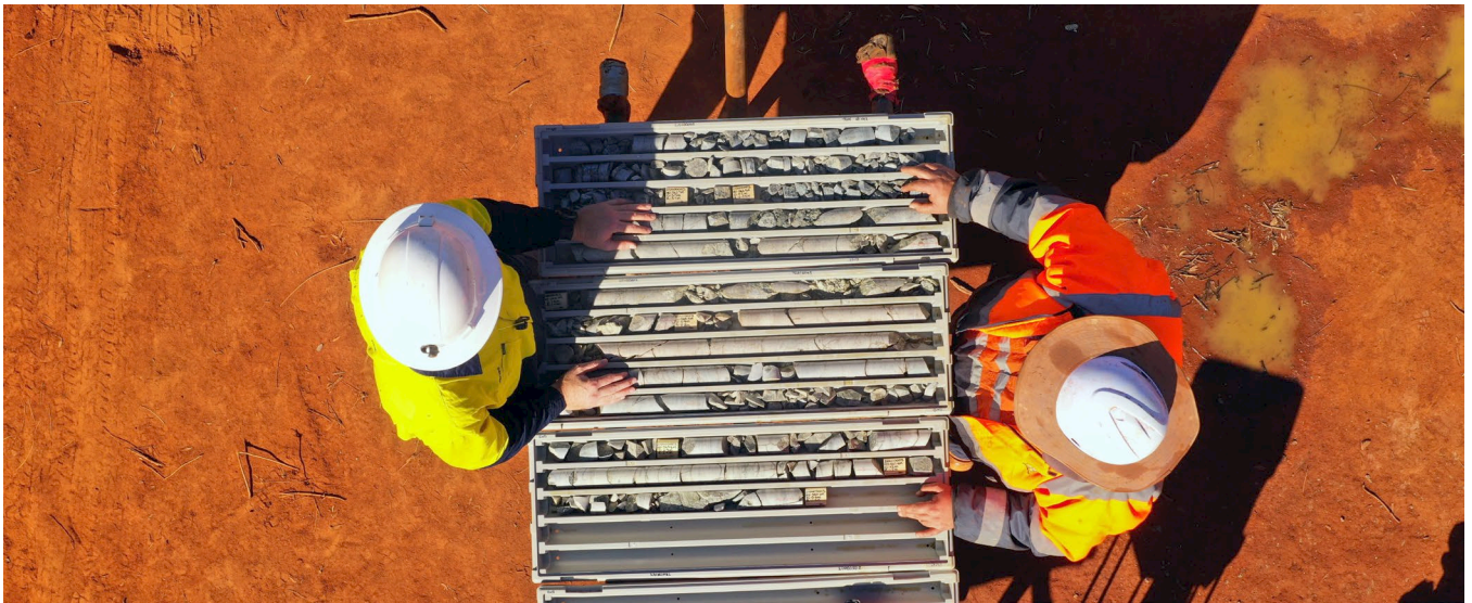
Figure 1: SensOre drilling at Desdemona North, 2021.