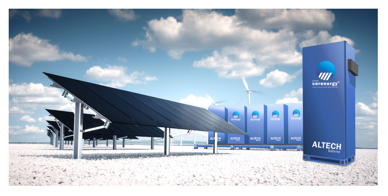
ABS60 CERENERGY® Battery Packs ideally suited for Renewable Energy Storage

Combining wind and solar with battery storage offers many advantages. The Wheatridge Renewable Energy Project in Oregon is a typical example of how combining renewable energy sources with battery storage can help provide reliable, sustainable energy as utility companies look to reduce carbon emissions. In these kind of applications, large battery systems are installed close to solar and wind farms. Typically, lithium-ion batteries have largely been used by utilities to store renewable energy when the sun sets or the wind stops blowing. However, existing utility-scale storage can only discharge energy for up to four hours at a time, meaning that systems aren't able to provide widespread power for a longer period of time (eg: over the night period). There is a need for middle and long-duration batteries that provide sustained power for longer periods.